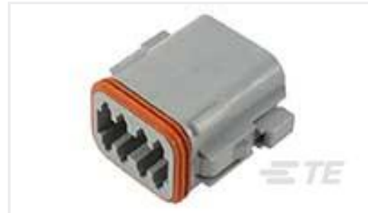
TE Part #DT06-08SA PLG, 8P, GRY, N, A