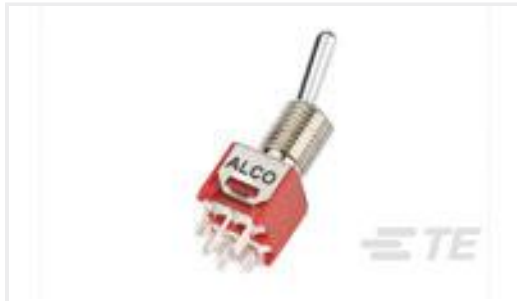
TE Part #2267078-8 TMD1T5B2M2RE