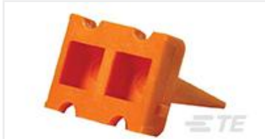
TE Part #WP-4P WEDGE LOCK, 4P, REC, ORG, DTP