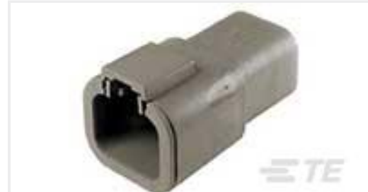
TE Part #DTP04-4P REC, 4P, GRY, N