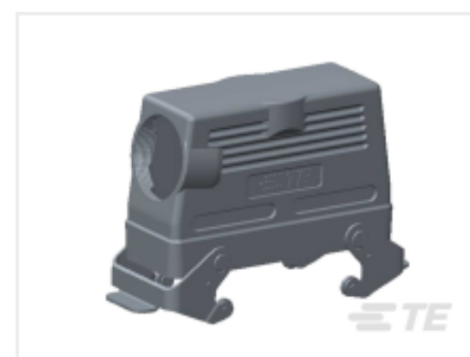
TE Part # T1270245129-000 H24B-TSBHS-EMC-PG29