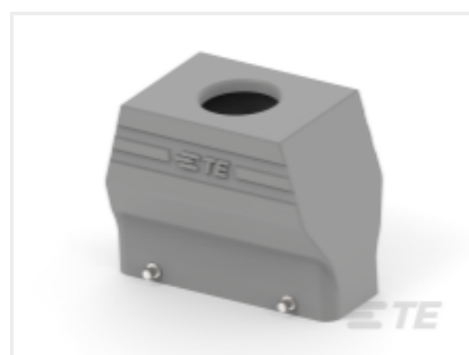
TE Part # T1246240129-000 H24B-XWTGH-PG29