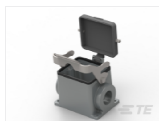
TE Part # T1620320129-000 H32B-SDR-LB-PG29