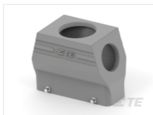
TE Part # T1196245029-000 H24B-XWTG/TSH-PG29/M50