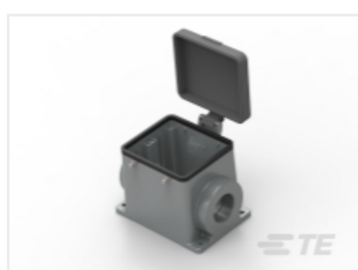
TE Part # T1460320229-000 H32B-SDR-BO-2PG29