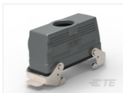
TE Part # T1710242129-000 H24B-TBF-PG29