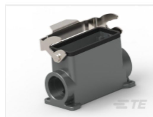
TE Part # T1650163229-000 H16B-SGRH-LB-2PG29