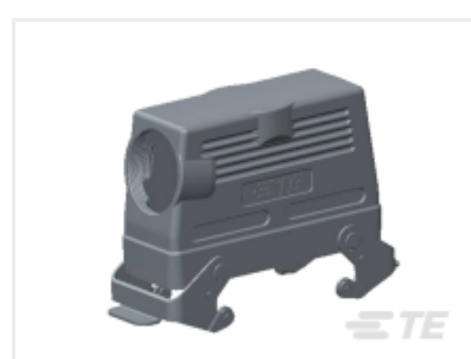
TE Part # T1270243129-000 H24B-TSBHS-PG29