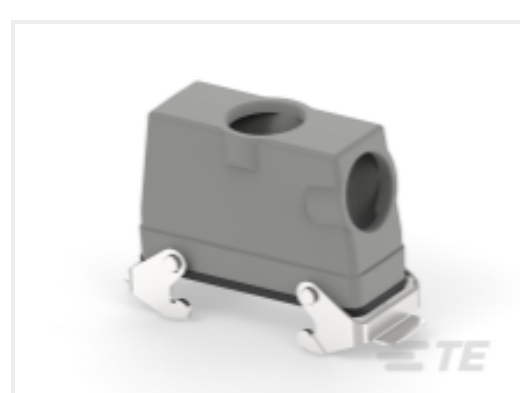
TE Part # T1790242129-000 H24B-TBFH-PG29