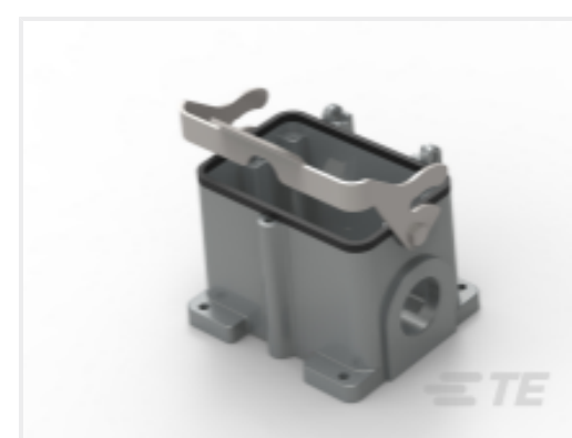
TE Part # T1610482229-000 H48B-SGR-LB-2PG29