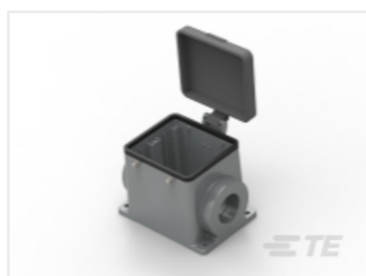
TE Part # T1460320129-000 H32B-SDR-BO-PG29