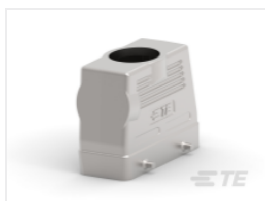
TE Part # T1240165129-000 H16B-TGH-EMC-M29