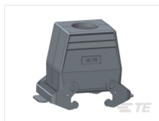
TE Part # T1739320129-000 H32A-TBF-PG29