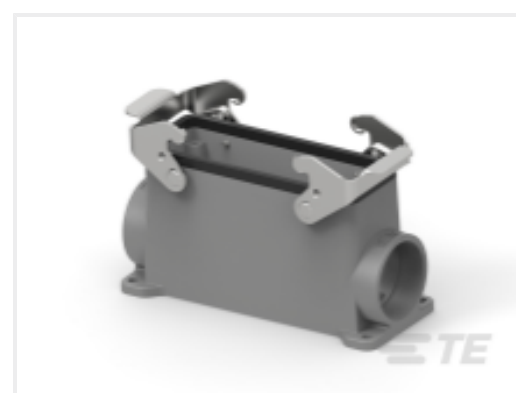
TE Part # T1470242229-001 H24B-SGRH-2PG29/M32