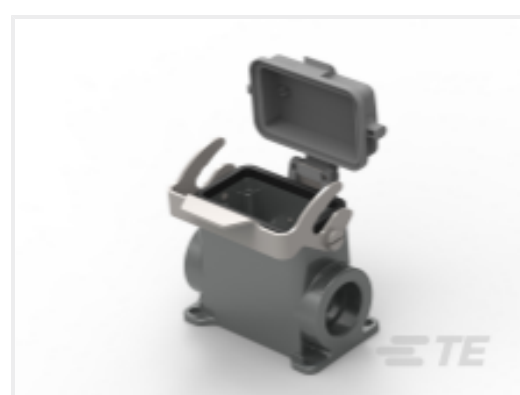
TE Part # T1660103229-000 H10B-SDRH-LB-2PG29