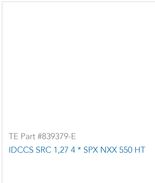
TE Part #839379-E IDCCS SRC 1,27 4 * SPX NXX 550 HT