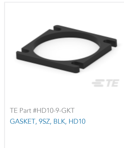
TE Part #HD10-9-GKT GASKET, 9SZ, BLK, HD10