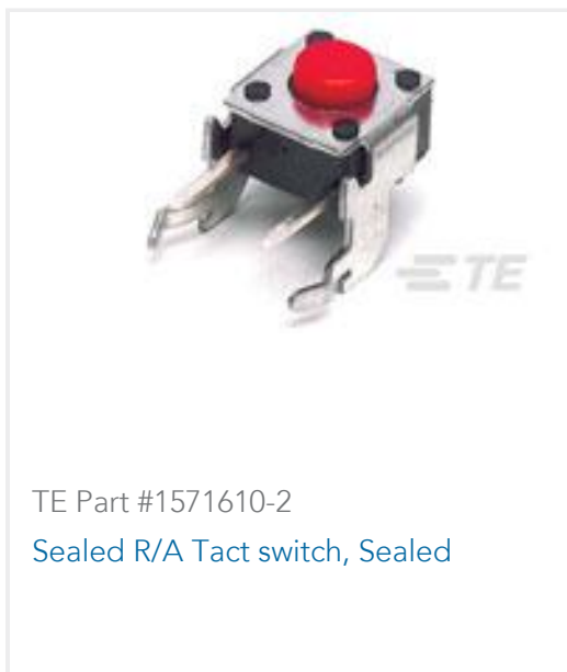
TE Part #1571610-2 Sealed R/A Tact switch, Sealed