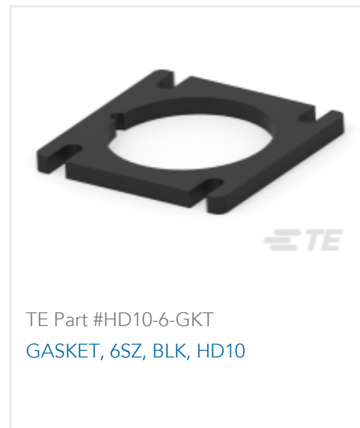
TE Part #HD10-6-GKT GASKET, 6SZ, BLK, HD10