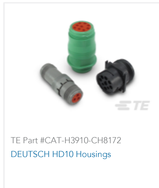
TE Part #CAT-H3910-CH8172 DEUTSCH HD10 Housings