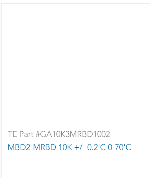
TE Part #GA10K3MRBD1002 MBD2-MRBD 10K +/- 0.2'C 0-70'C