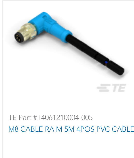
TE Part #T4061210004-005 M8 CABLE RA M 5M 4POS PVC CABLE