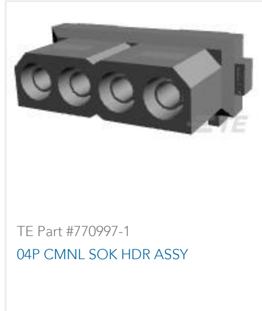
TE Part #770997-1 04P CMNL SOK HDR ASSY