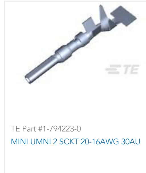
TE Part #1-794223-0 MINI UMNL2 SCKT 20-16AWG 30AU