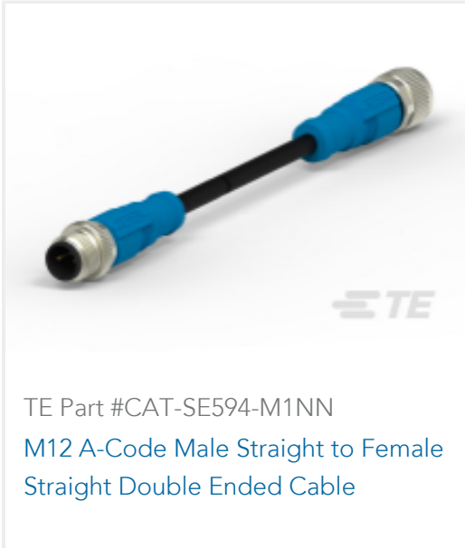
TE Part #CAT-SE594-M1NN M12 A-Code Male Straight to Female Straight Double Ended Cable