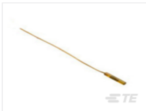
TE Part # CAT-NTC0065 Thermistor Probe — Micro BetaCHIP (MCD)