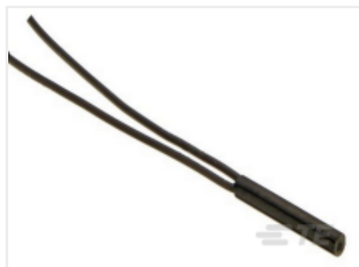
TE Part # GA10K3MRBD1 MBD9-MRBD