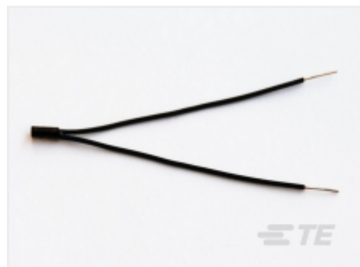
TE Part # GA100K6MRBD1 MBD PROBE, 100K @25C, 0.2 FROM 0 TO 70