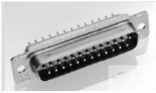
TE Part #1757823-3 AMPLIMITE,ASY,PLUG,STD,90,ZN,3