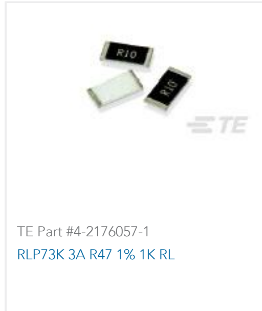
TE Part #4-2176057-1 RLP73K 3A R47 1% 1K RL