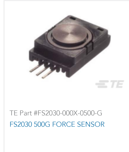
TE Part #FS2030-000X-0500-G FS2030 500G FORCE SENSOR