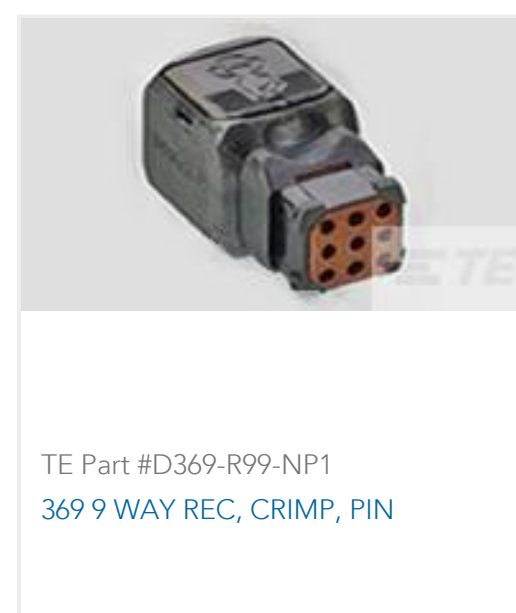
TE Part #D369-R99-NP1 369 9 WAY REC, CRIMP, PIN