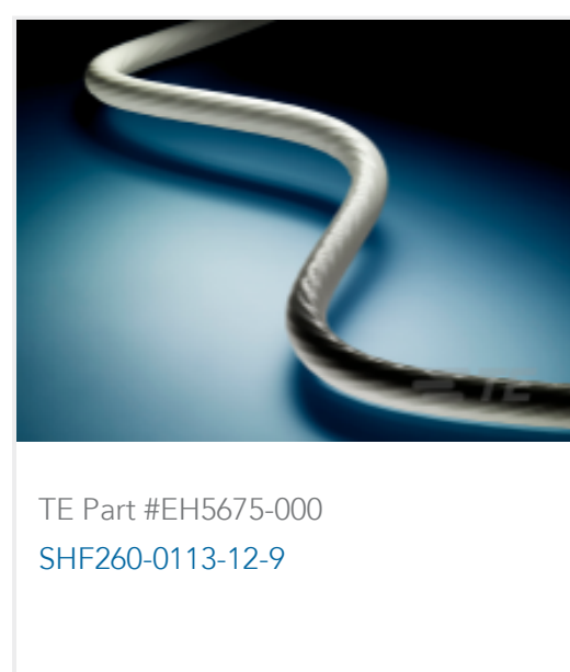
TE Part #EH5675-000 SHF260-0113-12-9