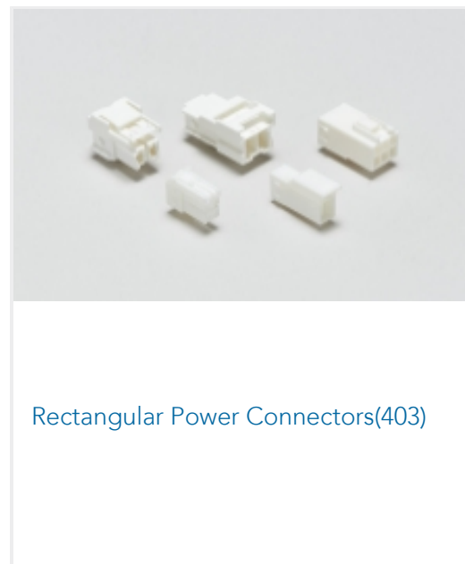
Rectangular Power Connectors(403)