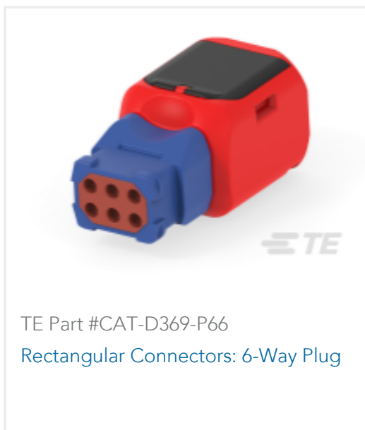
TE Part #CAT-D369-P66 Rectangular Connectors: 6-Way Plug