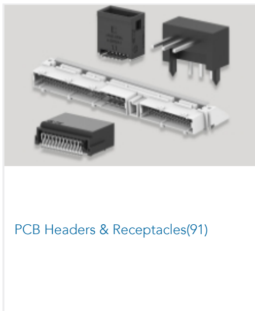
PCB Headers & Receptacles(91)