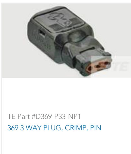
TE Part #D369-P33-NP1 369 3 WAY PLUG, CRIMP, PIN