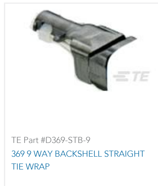
TE Part #D369-STB-9 369 9 WAY BACKSHELL STRAIGHT TIE WRAP