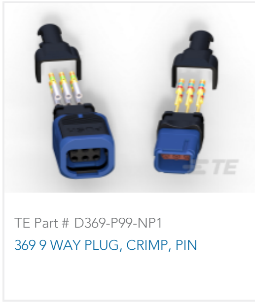
TE Part # D369-P99-NP1 369 9 WAY PLUG, CRIMP, PIN