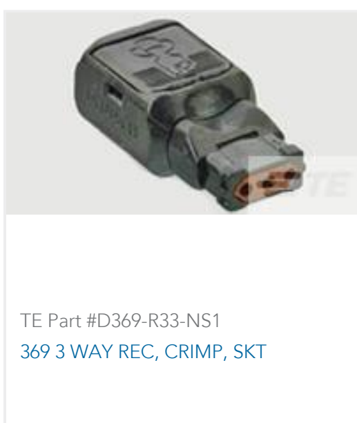
TE Part #D369-R33-NS1 369 3 WAY REC, CRIMP, SKT