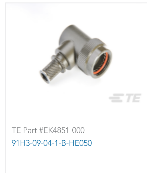
TE Part #EK4851-000 91H3-09-04-1-B-HE050