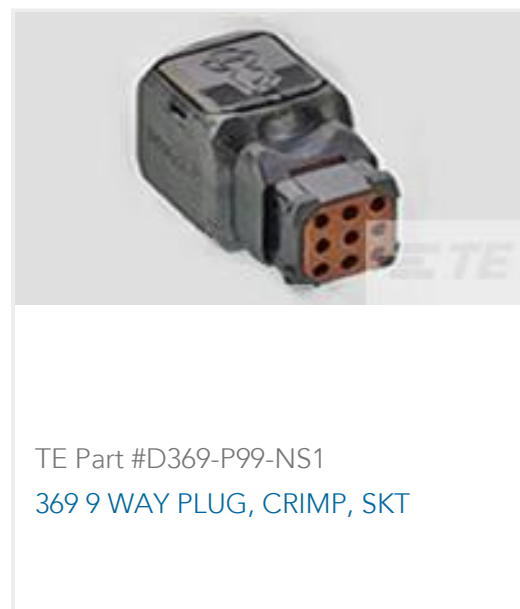
TE Part #D369-P99-NS1 369 9 WAY PLUG, CRIMP, SKT