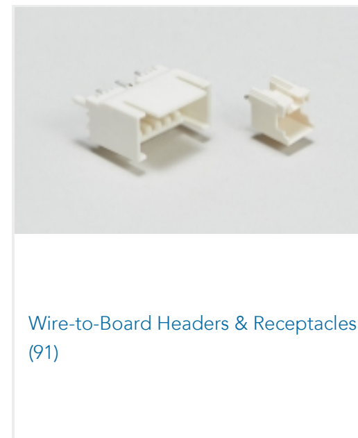
Wire-to-Board Headers & Receptacles (91)