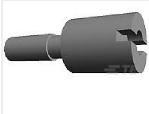
TE Part #787004-3 .8MM SCREWLOCK BRDMT, BULK