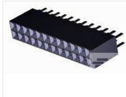
TE Part #1-534206-2 24 MODII VRT DR CE 100/115