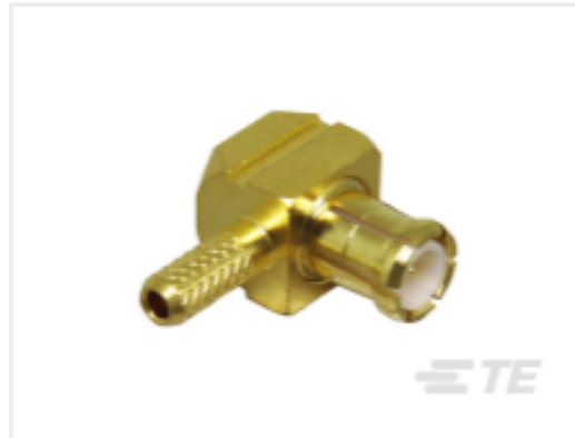
TE Part #CONMCX012-R178 MCX Plug 50 Ohm Cable Crimp