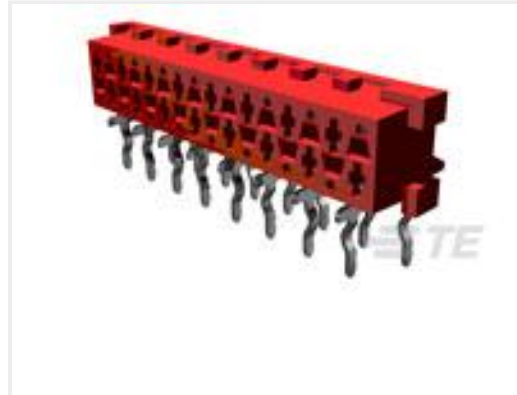
TE Part #1-215460-8 MICRO-MATCH FEM.SE