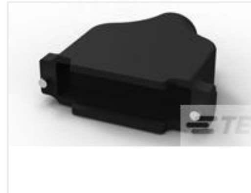
TE Part #5748677-3 PLTD PLST CBL CLMP KIT, SZ 3