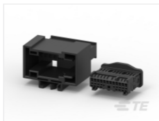
TE Part # CAT-M8793-CH8172 MQS, CONNECTOR HOUSING