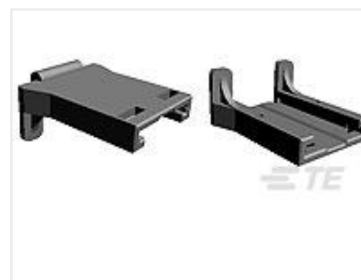
TE Part # 953381-1 LOCKING DEVICE FOR 6W MQS