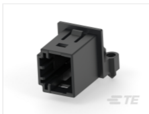
TE Part # 953440-5 6W MQS HEADER BENT RIGHT