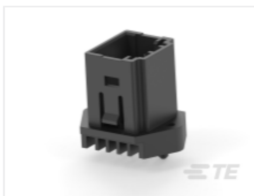
TE Part # 953363-5 HEADER ASSY, 6W, STRAIGHT WITH EAR, MQS