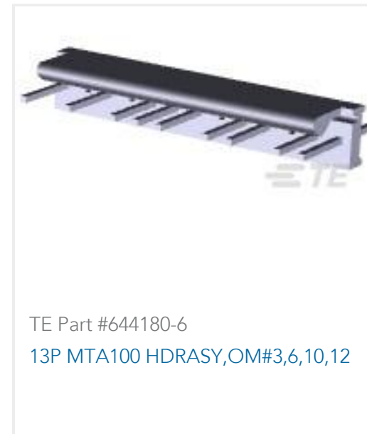
TE Part #644180-6 13P MTA100 HDRASY,OM#3,6,10,12