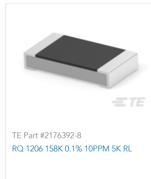
TE Part #2176392-8 RQ 1206 158K 0.1% 10PPM 5K RL