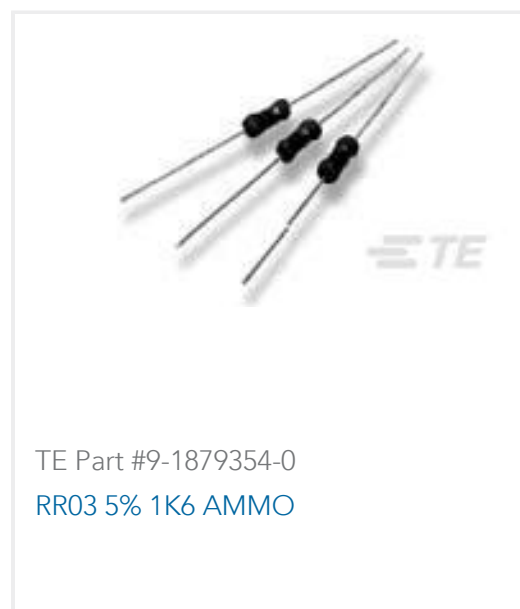
TE Part #9-1879354-0 RR03 5% 1K6 AMMO