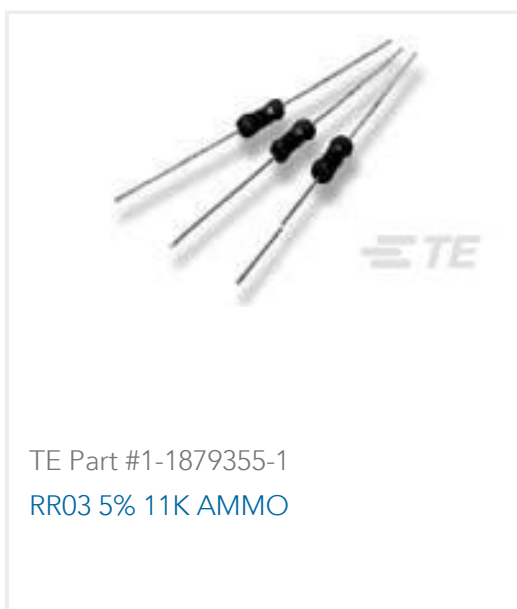
TE Part #1-1879355-1 RR03 5% 11K AMMO