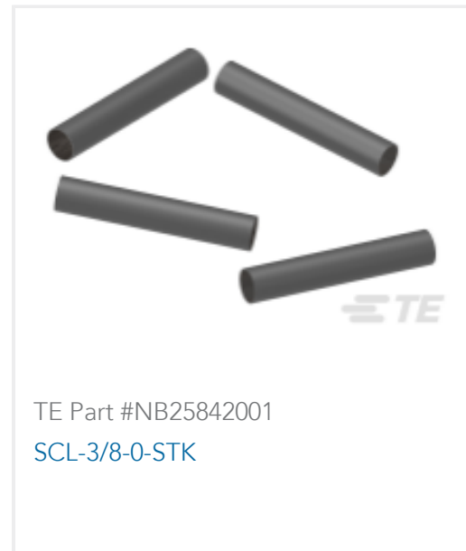
TE Part #NB25842001 SCL-3/8-0-STK