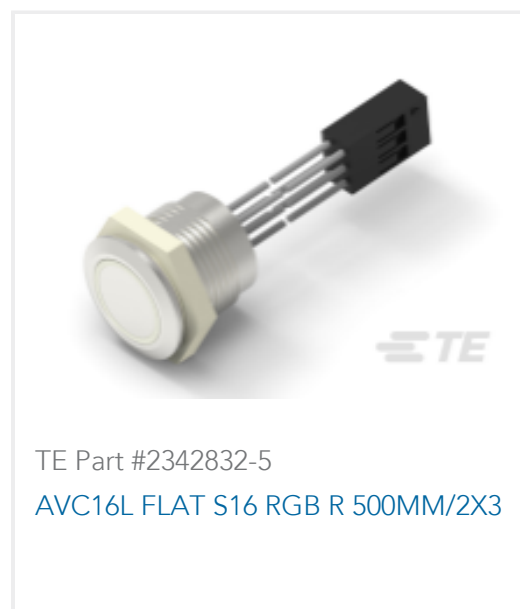
TE Part #2342832-5 AVC16L FLAT S16 RGB R 500MM/2X3