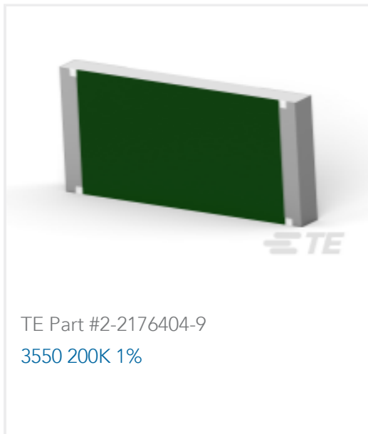
TE Part #2-2176404-9 3550 200K 1%