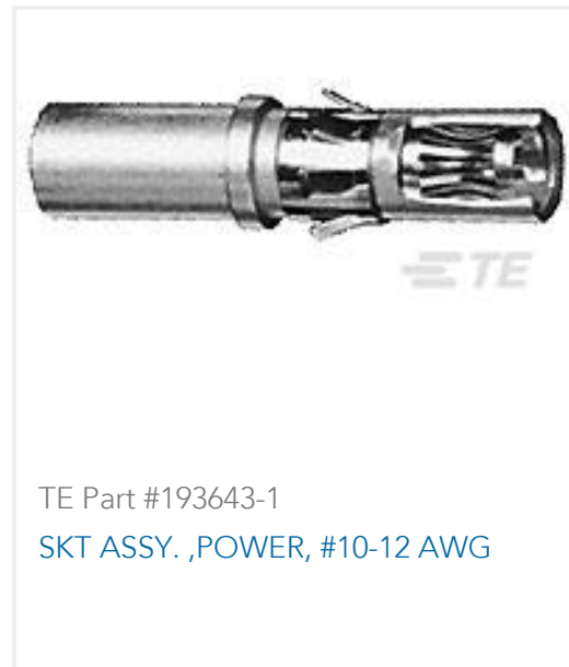
TE Part #193643-1 SKT ASSY. ,POWER, #10-12 AWG