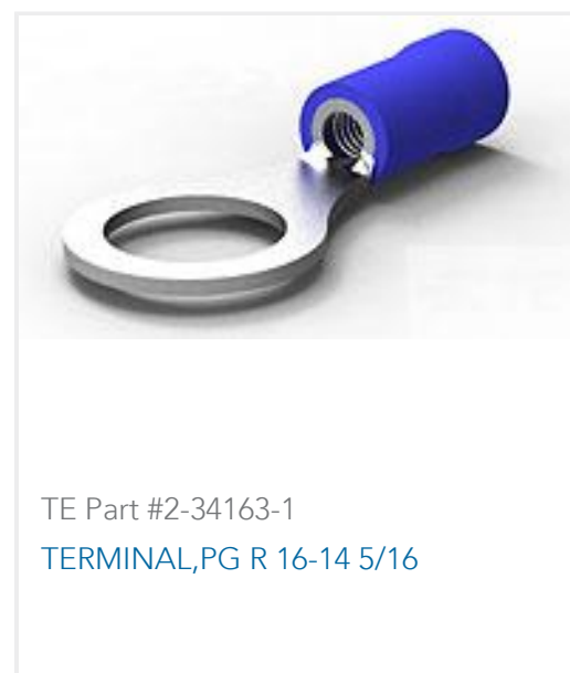
TE Part #2-34163-1 TERMINAL,PG R 16-14 5/16