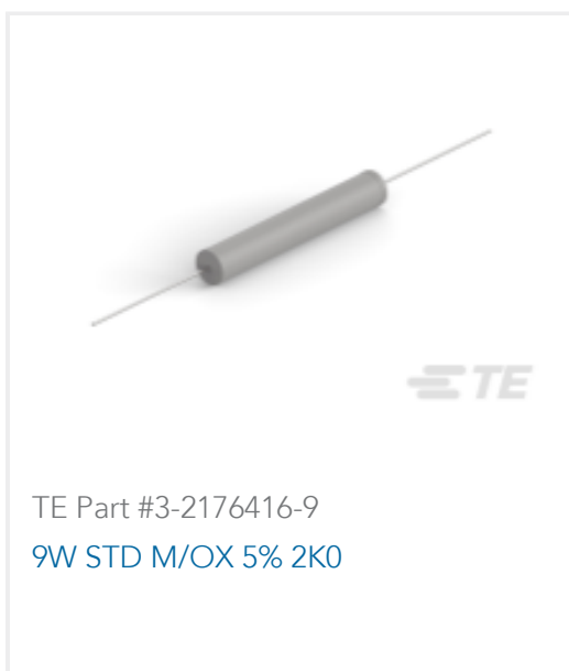
TE Part #3-2176416-9 9W STD M/OX 5% 2K0