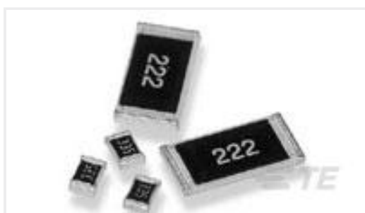
TE Part #8-1879494-1 CRGH0603 5% 2K2 0.2W