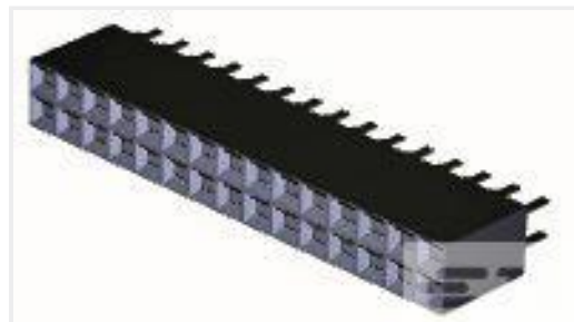
TE Part #6-534206-5 30 MODII VRT DR CE 100/115 L