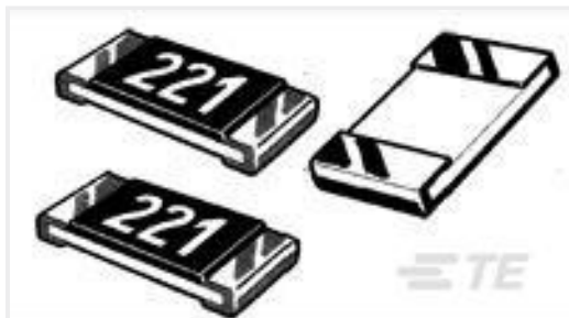
TE Part #3-2176070-7 3521 330R 1% 2W