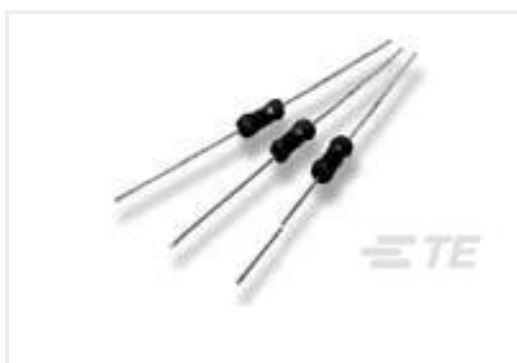
TE Part #4-1625892-5 3W SM M/OX 5% 39K