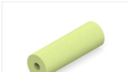
TE Part #2420757-1 FSA Tube 3.2mm OD x 1.1mm ID x 1m L