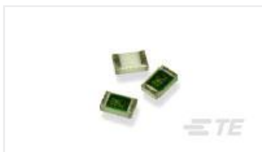
TE Part #1879417-8 CPF0603 1M0 0.1% 25PPM 5K RL