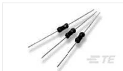
TE Part #8-1879354-3 RR03 5% 820R AMMO