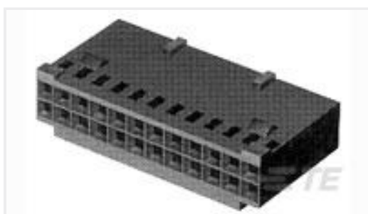
TE Part #87631-9 14 MODIV HSG COMP DR .100 POL