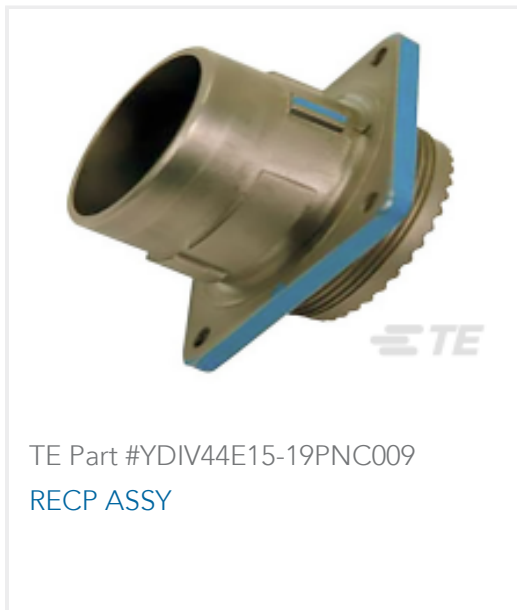
TE Part #YDIV44E15-19PNC009 RECP ASSY