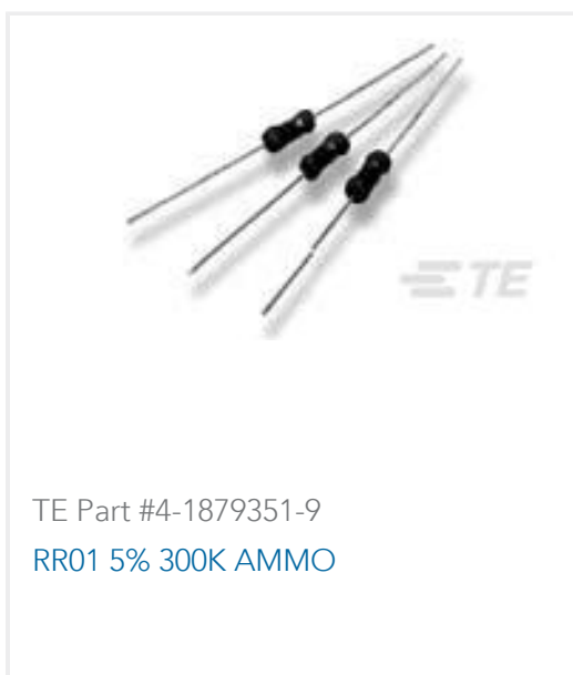
TE Part #4-1879351-9 RR01 5% 300K AMMO