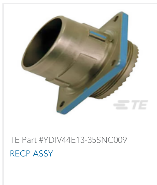
TE Part #YDIV44E13-35SNC009 RECP ASSY