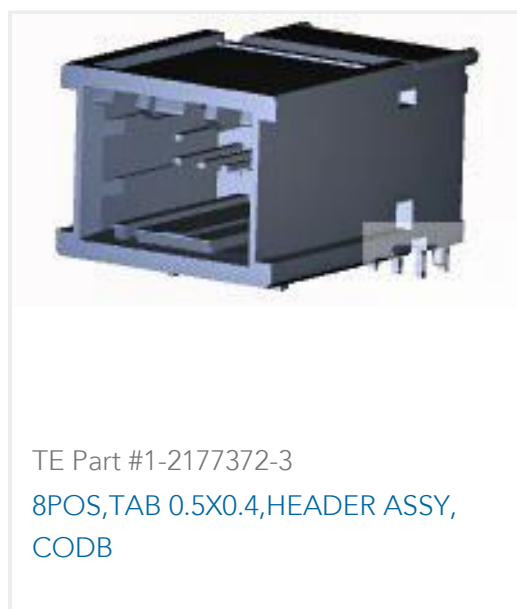
TE Part #1-2177372-3 8POS,TAB 0.5X0.4,HEADER ASSY, CODB