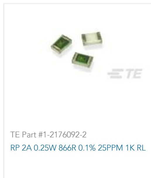
TE Part #1-2176092-2 RP 2A 0.25W 866R 0.1% 25PPM 1K RL