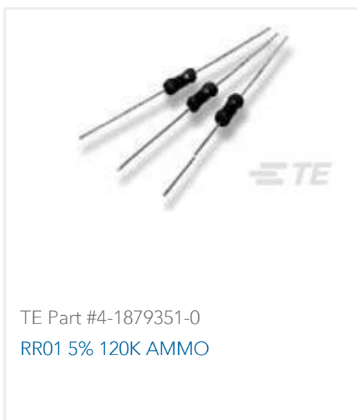
TE Part #4-1879351-0 RR01 5% 120K AMMO