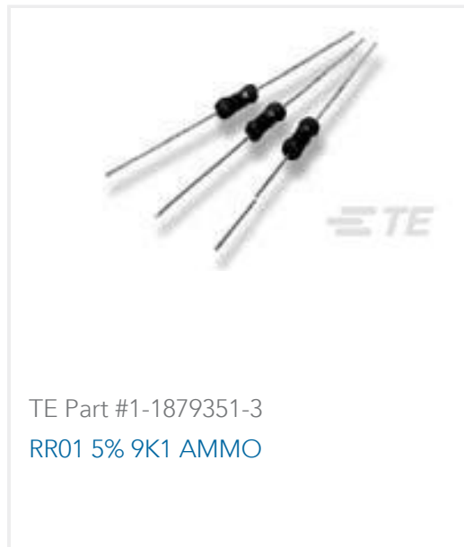
TE Part #1-1879351-3 RR01 5% 9K1 AMMO