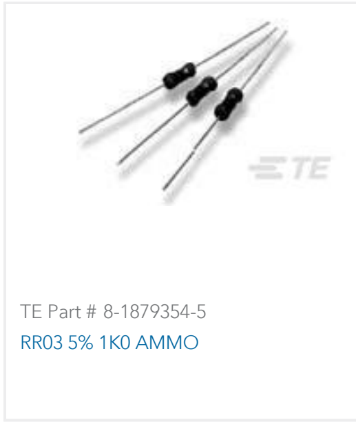
TE Part # 8-1879354-5 RR03 5% 1K0 AMMO