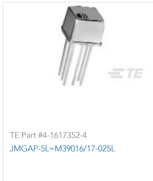
TE Part #4-1617352-4 JMGAP-5L=M39016/17-025L