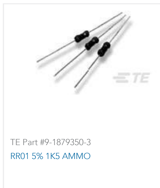
TE Part #9-1879350-3 RR01 5% 1K5 AMMO