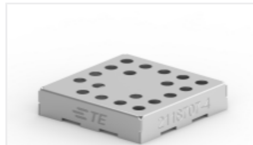
TE Part #2118707-4 1 PC STD SHIELD, AL-16.50X16.50X3.60MM