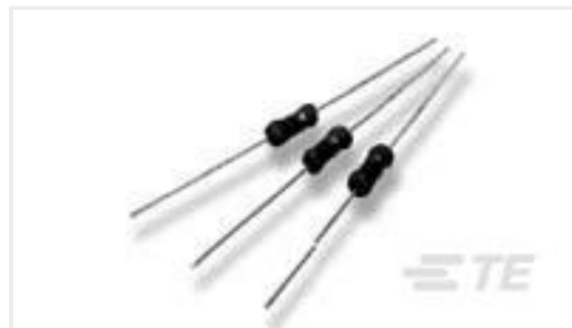
TE Part #4-1625890-2 2W SM M/OX 5% 33K