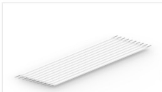
TE Part #3-1437144-1 FSN-23A-14=NOMEX FS STD