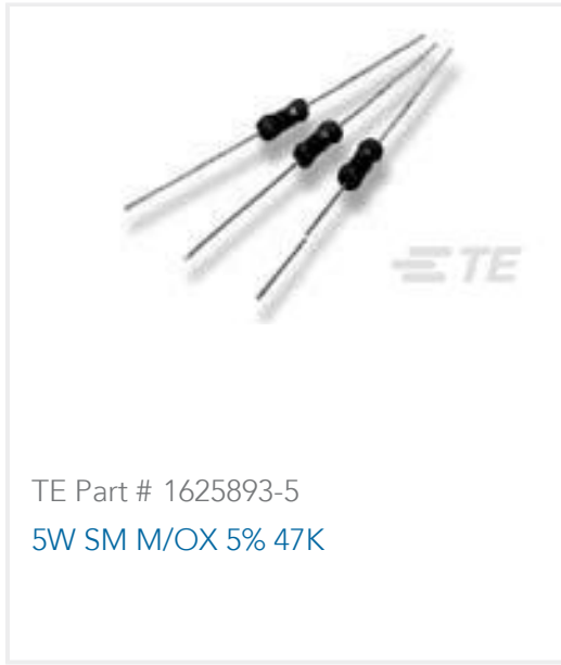
TE Part # 1625893-5 5W SM M/OX 5% 47K