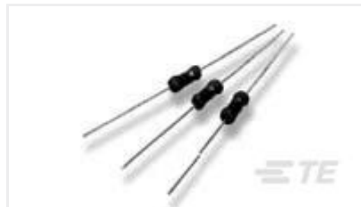
TE Part #4-1625892-8 3W SM M/OX 5% 3K9