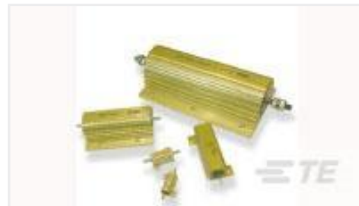
TE Part #5-1625984-9 HSA50 470R 5%