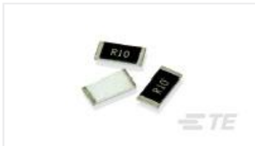
TE Part #2-2176055-7 RLP73K 2B R12 1% 1K RL