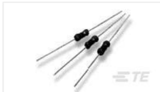
TE Part #3-1625890-2 2W SM M/OX 5% 22K