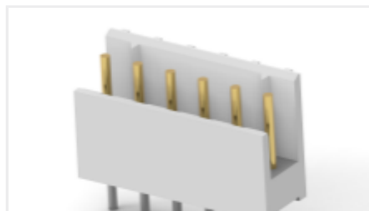
TE Part #828548-6 6P AMP QUICK STLEI