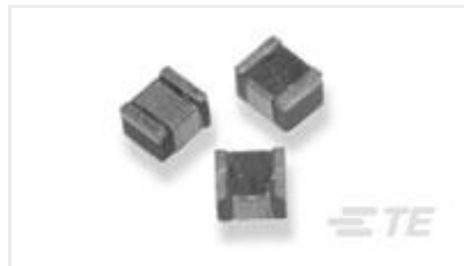
TE Part #3-1624112-2 3650 0402 3.9nH 5% 2K RL