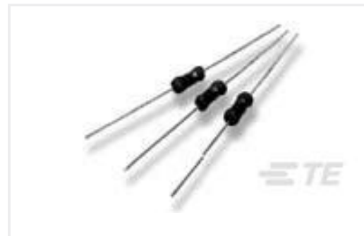
TE Part #1879353-5 RR02 5% 6K2 AMMO