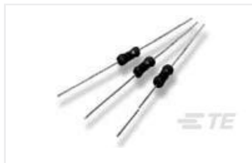
TE Part #2-1879353-4 RR02 5% 39K AMMO