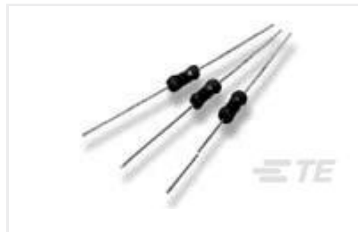
TE Part #2-1879353-0 RR02 5% 27K AMMO