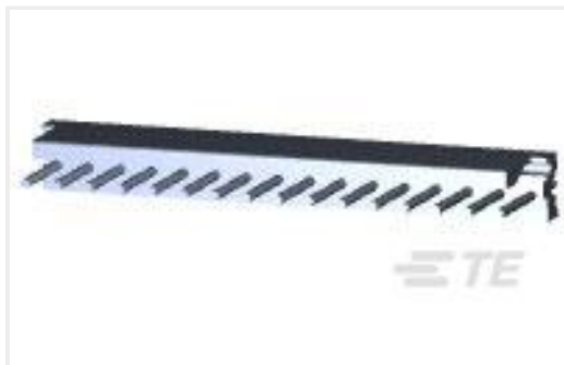
TE Part #1-640388-6 16P MTA156 HDR ASSY RN STR F/L