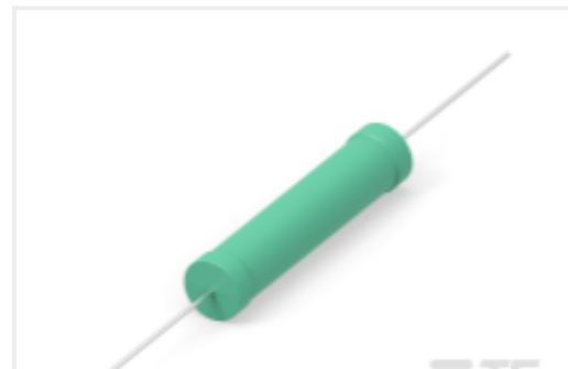
TE Part #4-2176614-3 EP 10W (SS) 56R 5% BULK BOX