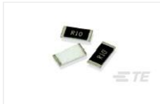
TE Part #4-1879463-1 RL73H 2E R47 1% 1K RL