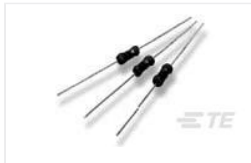
TE Part #1-1879353-4 RR02 5% 15K AMMO