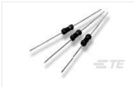
TE Part #6-1879352-2 RR02 5% 110R AMMO