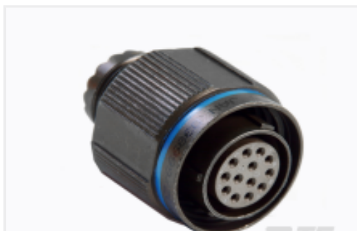
TE Part #YDTS26W25-20SNV001 PLUG ASSY