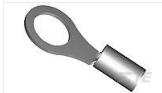
TE Part #320760 TERM BODY-RING TONGUE