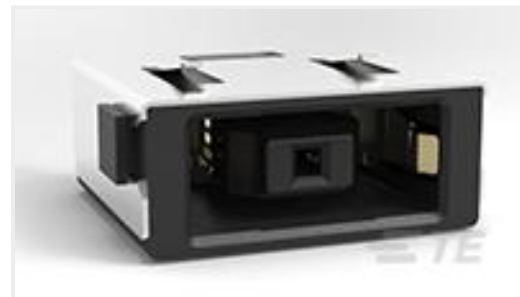
TE Part #2129567-1 DC Power Jack Conn cable type 10.7A