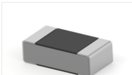
TE Part #9-1879132-7 RN 0402 22K6 0.1% 10PPM 5K RL