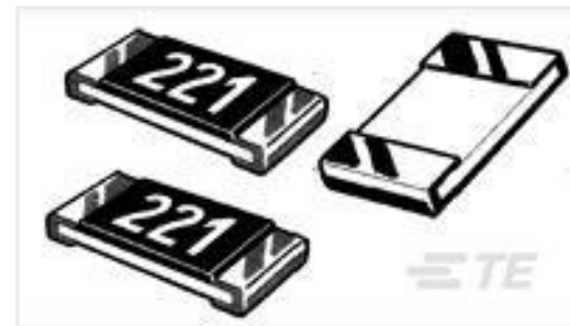
TE Part #6-2176230-3 3522 120K 5% 3W