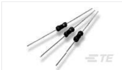
TE Part #5-1879354-7 RR03 5% 68R AMMO