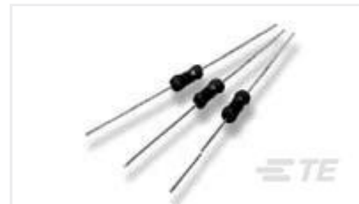
TE Part #7-1879354-5 RR03 5% 390R AMMO