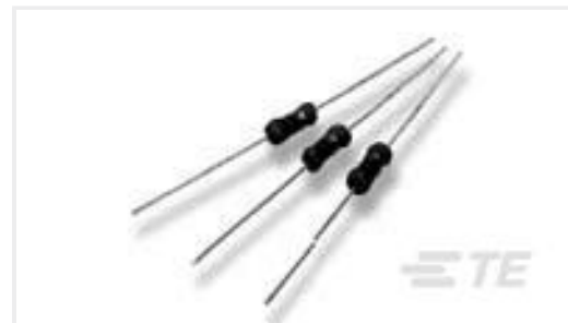
TE Part #6-1879354-2 RR03 5% 110R AMMO