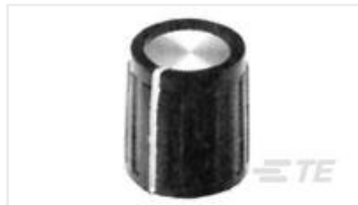
TE Part #6-1437624-1 PKG50B1/8=KNOB PLASTIC 1/8 LEX