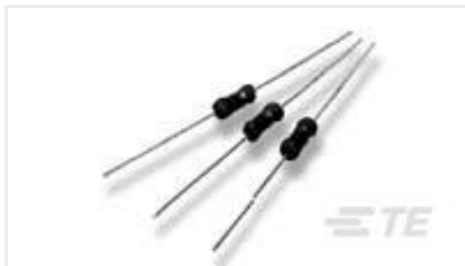
TE Part #6-1879354-7 RR03 5% 180R AMMO