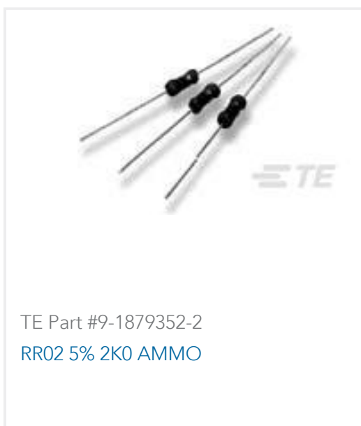
TE Part #9-1879352-2 RR02 5% 2K0 AMMO