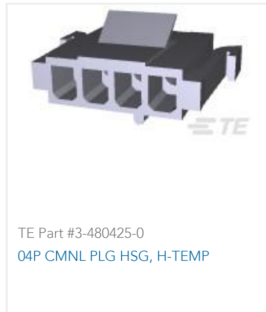
TE Part #3-480425-0 04P CMNL PLG HSG, H-TEMP