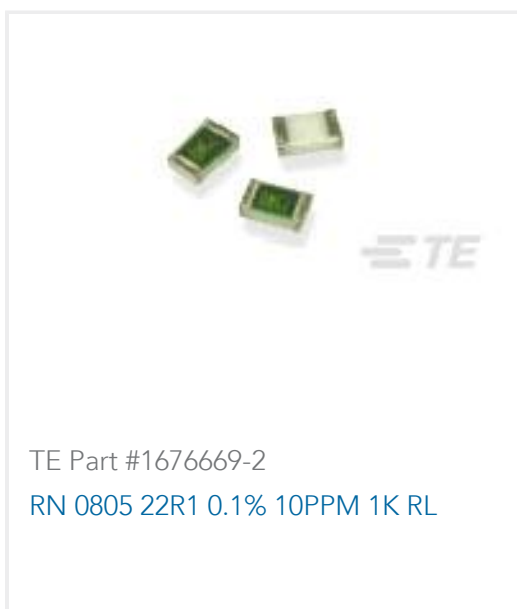
TE Part #1676669-2 RN 0805 22R1 0.1% 10PPM 1K RL