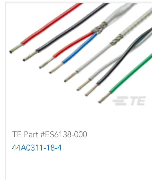
TE Part #ES6138-000 44A0311-18-4