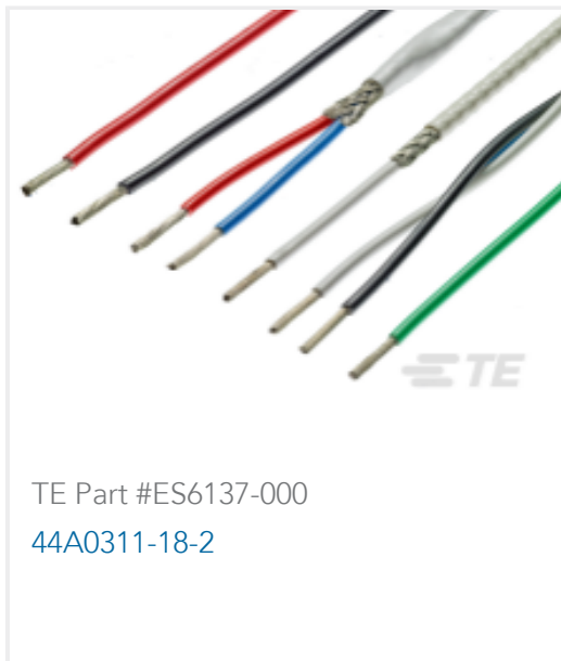
TE Part #ES6137-000 44A0311-18-2