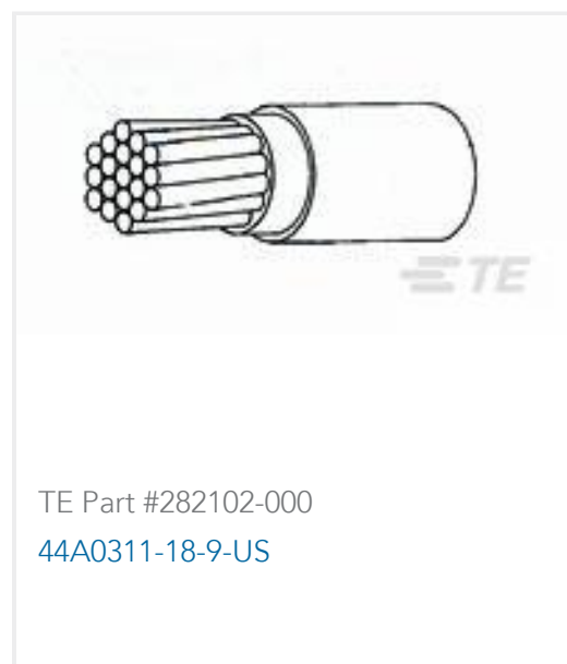
TE Part #282102-000 44A0311-18-9-US