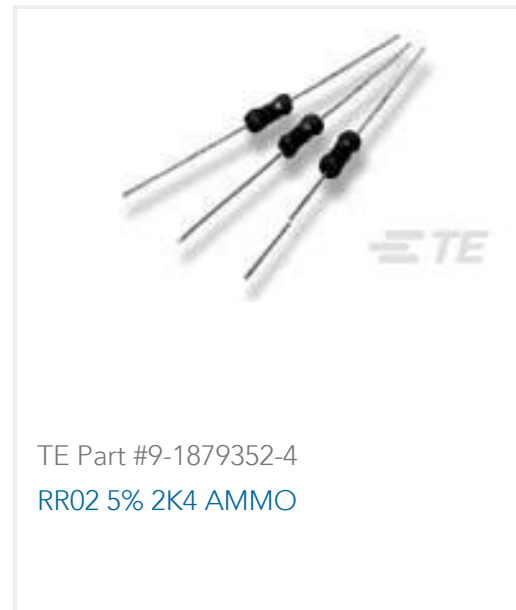
TE Part #9-1879352-4 RR02 5% 2K4 AMMO