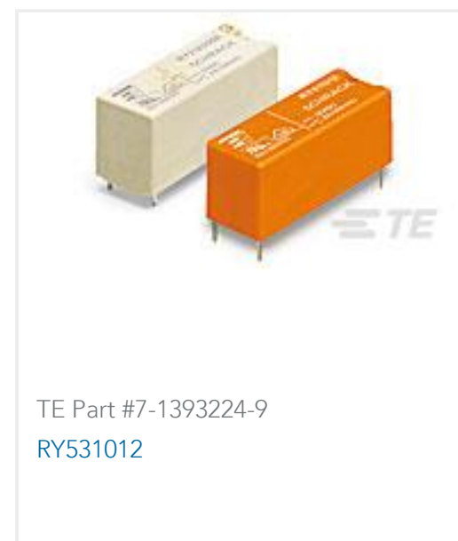
TE Part #7-1393224-9 RY531012