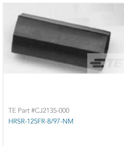
TE Part #CJ2135-000 HRSR-125FR-8/97-NM