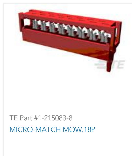
TE Part #1-215083-8 MICRO-MATCH MOW.18P