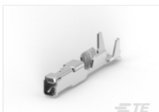
TE Part # CAT-N57-GYTH68 Generation Y Terminals, 68POS Hybrid