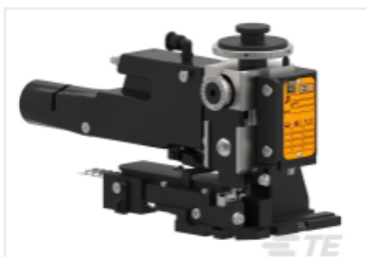
TE Part # 2150983-1 OCEAN-2.0-APPLICATOR-E-100F180F-REM