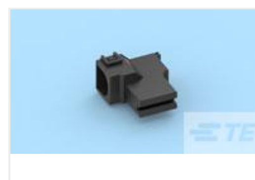
TE Part # 1969507-3 250 FASTON HSG., FLAG, REC., 1 POS, BLACK