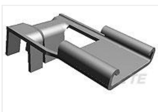
TE Part # 60290-2 250 FASTON FLAG REC 18-14 AWG TPBR