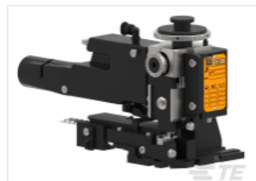
TE Part # 5-2151049-2 OCEAN_2.0-APPLICATOR-S-070F130O-RSA