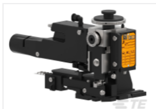
TE Part # 2150983-2 OCEAN-2.0-APPLICATOR-E-100F180F-REA