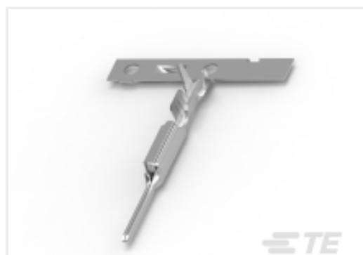
TE Part # 1924968-8 CONTACT, MALE 0.64, 0.35SQMM