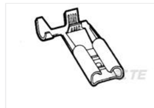
TE Part # 180464-2 250 FASTON, FLAG, REC., 14-17AWG, LATON