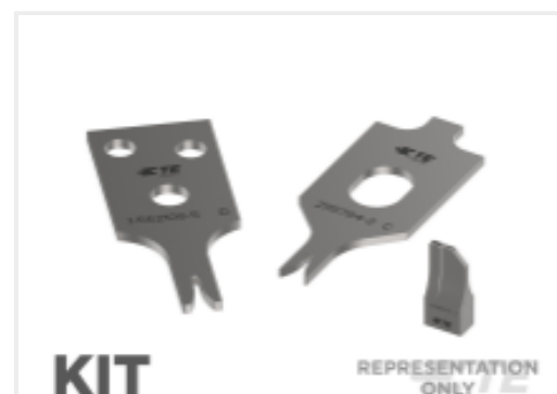
TE Part # 7-2150983-7 OCEAN_2.0_SPARE_PART_KIT-100F180F