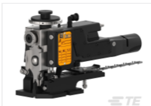
TE Part # 2150117-2 OCEAN-2.0-APPLICATOR-E-110F-SEA