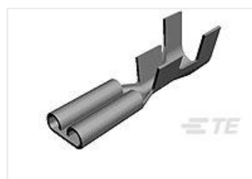
TE Part # 42640-2 250 FASTON REC 22-18 AWG TPBR