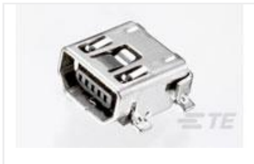
TE Part #1734328-2 Mini USB AB R/A,Rcpt,SMT,T&R