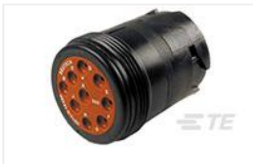
TE Part #HD14-9-1939P REC, 9P, BLK, N, THRD, J1939, TYPE 1