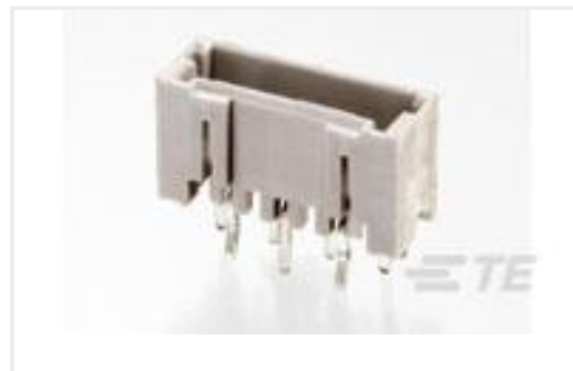
TE Part #2-292207-0 MINI CT SGL DIP V 20P NAT