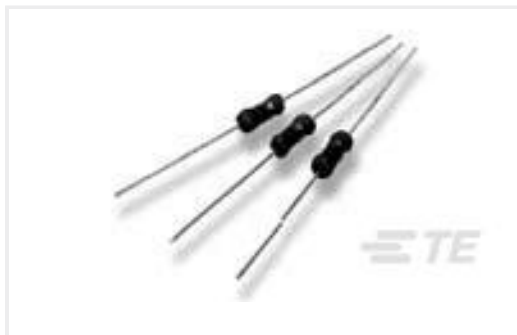
TE Part #6-1879354-0 RR03 5% 91R AMMO