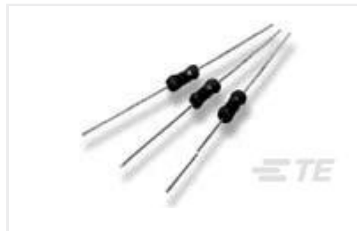
TE Part #6-1879354-1 RR03 5% 100R AMMO