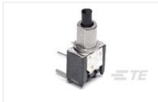
TE Part #1825095-3 TP11CGRA004