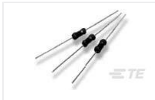
TE Part #6-1879354-5 RR03 5% 150R AMMO