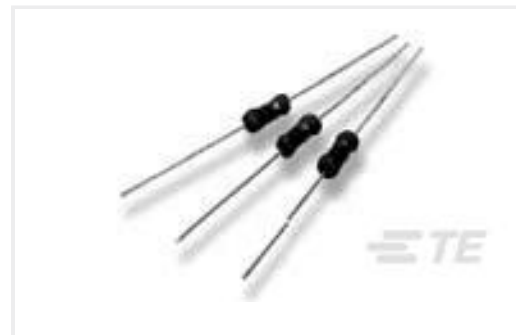
TE Part #7-1879354-0 RR03 5% 240R AMMO