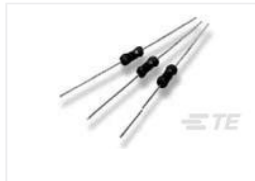
TE Part #7-1879350-0 RR01 5% 160R AMMO