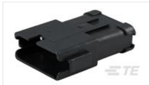
TE Part #DT04-12PB-P016 REC, 12P, BLK, BUSBAR 1X12, GOLD, B