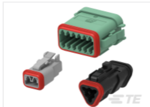
TE Part #CAT-J41-DDPC DEUTSCH DT Plug Connectors