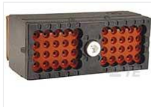
TE Part #DRC16-40S PLG, 40P, BLK, N