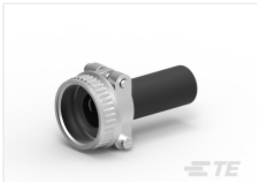
TE Part #0409-201-1800 CABLE CLAMP, 18SZ, AL