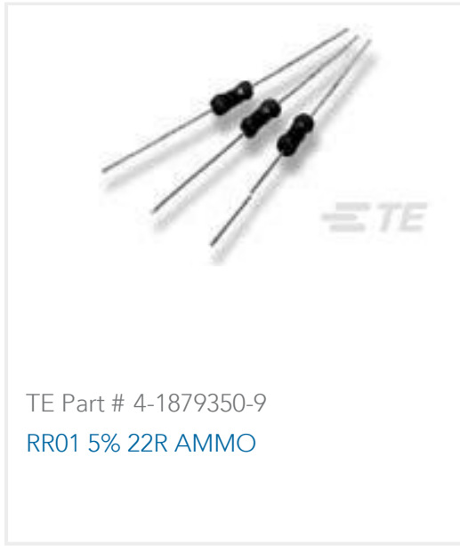
TE Part # 4-1879350-9 RR01 5% 22R AMMO