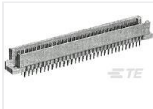
TE Part #5650908-5 ASSY,PIN,EUROCARD,TYPE R,LEAD-