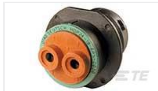
TE Part #HDP24-18-6PN-C030 REC, 6P, BLK, N, 4, P