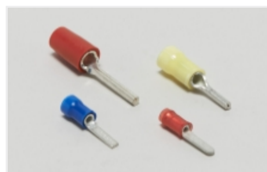
Crimp Wire Pins, Tabs & Ferrules(20)