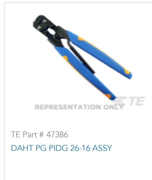
TE Part # 47386 DAHT PG PIDG 26-16 ASSY