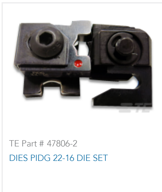
TE Part # 47806-2 DIES PIDG 22-16 DIE SET