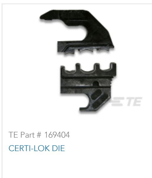
TE Part # 169404 CERTI-LOK DIE