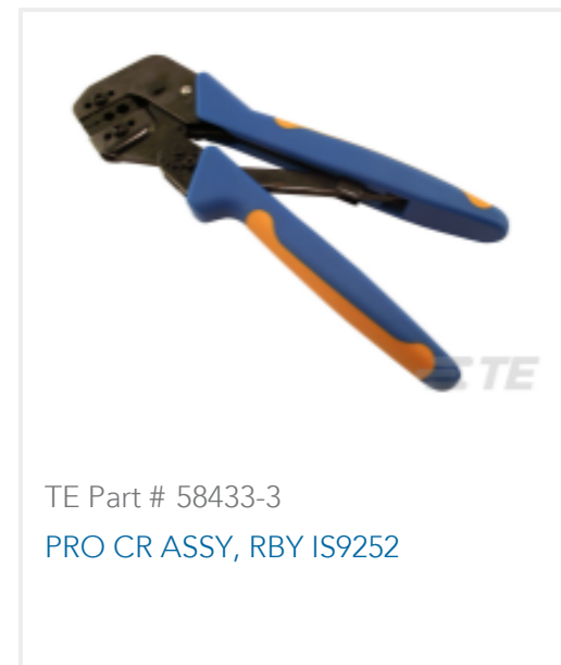
TE Part # 58433-3 PRO CR ASSY, RBY IS9252