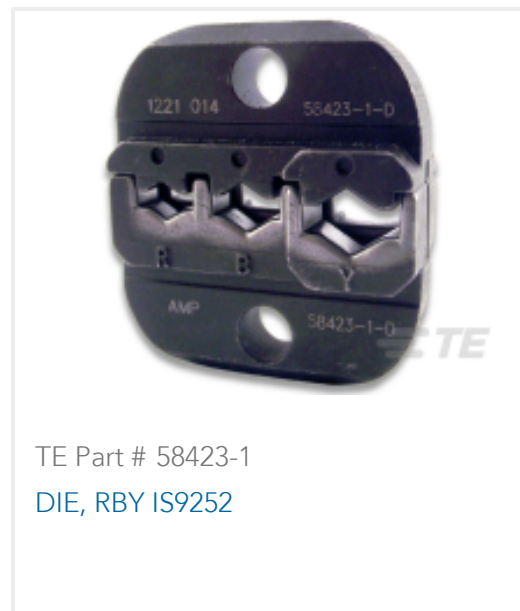
TE Part # 58423-1 DIE, RBY IS9252