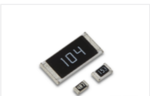
TE Part #6-2176343-0 CRGCO 1206 820K 1%