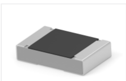
TE Part #6-2176529-5 3504G 3A 237R 1% 1K RL