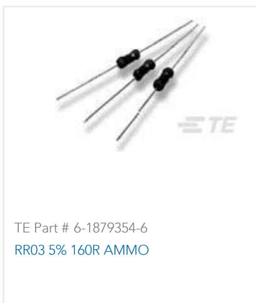
TE Part # 6-1879354-6 RR03 5% 160R AMMO