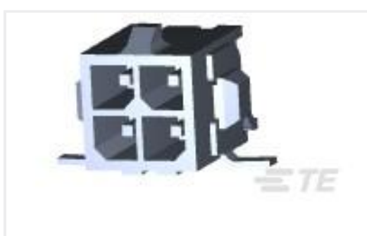
TE Part #3-794627-4 04P MICRO MNL ASSY,RA ,SMT, LF