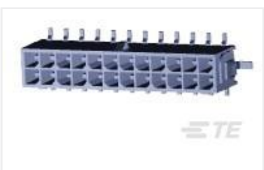
TE Part #5-794636-4 24P MICRO MNL ASSY,VRT,SMT,LF