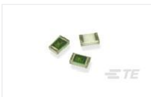
TE Part #1676437-2 RN 0805 7K5 0.1% 10PPM 1KRL