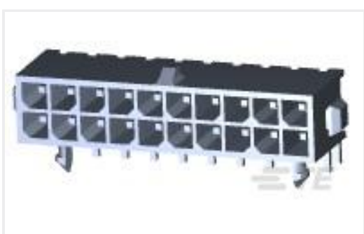
TE Part #5-794618-0 20P MICRO MNL ASSY R/A HDR LF