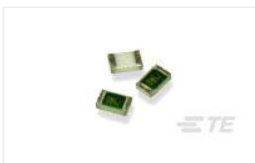
TE Part #1879216-3 CPF 0402 52K3 0.1% 25PPM 1K RL