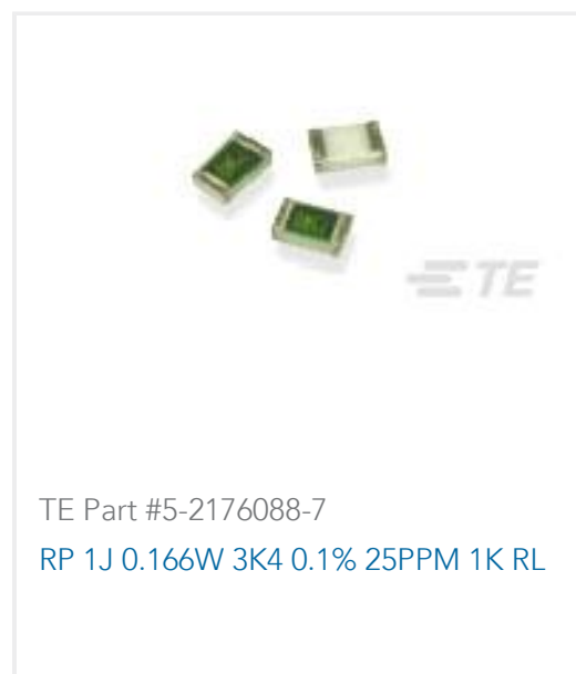
TE Part #5-2176088-7 RP 1J 0.166W 3K4 0.1% 25PPM 1K RL