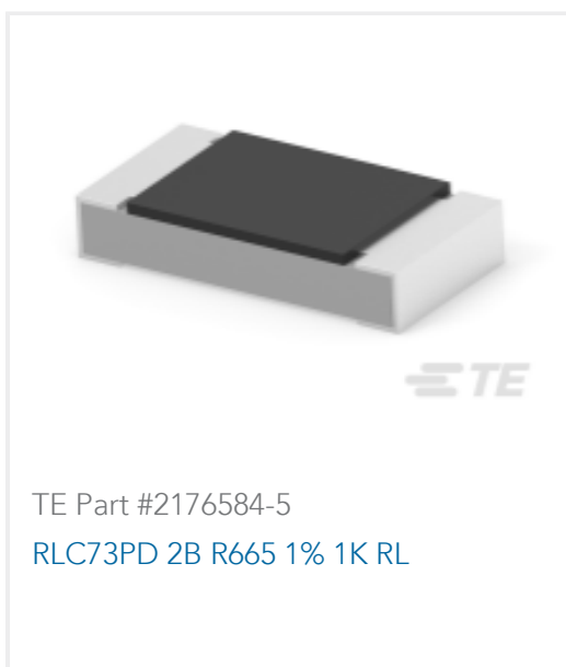
TE Part #2176584-5 RLC73PD 2B R665 1% 1K RL