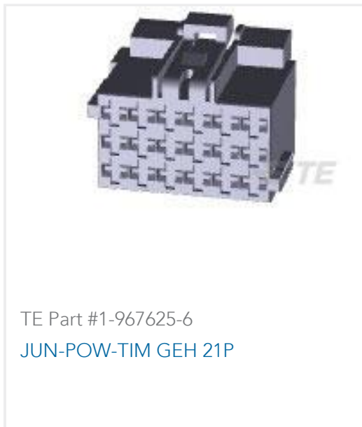
TE Part #1-967625-6 JUN-POW-TIM GEH 21P