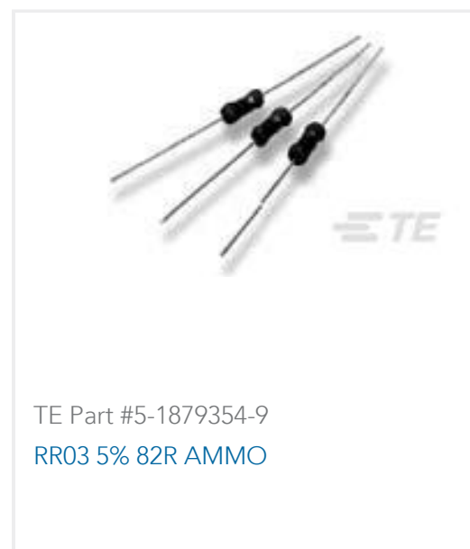
TE Part #5-1879354-9 RR03 5% 82R AMMO