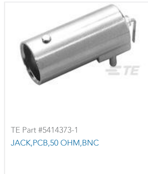
TE Part #5414373-1 JACK,PCB,50 OHM,BNC