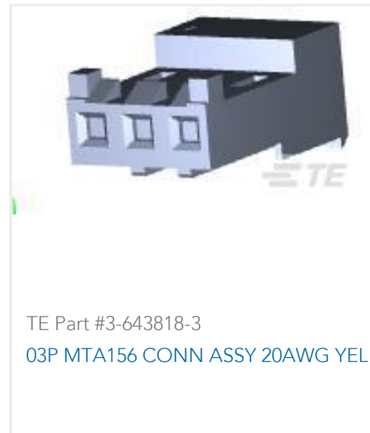
TE Part #3-643818-3 03P MTA156 CONN ASSY 20AWG YEL