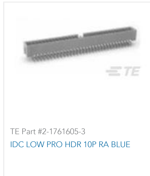
TE Part #2-1761605-3 IDC LOW PRO HDR 10P RA BLUE