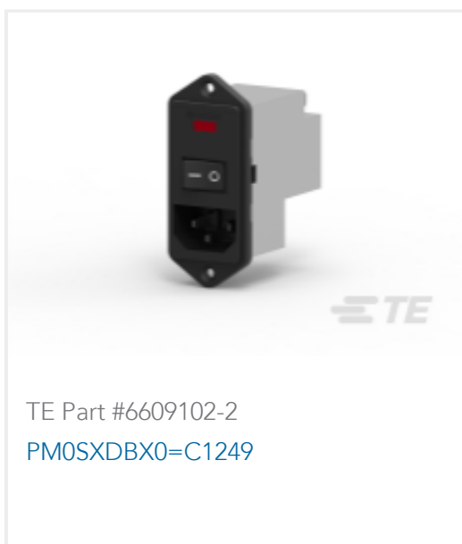
TE Part #6609102-2 PMOSXDBX0=C1249