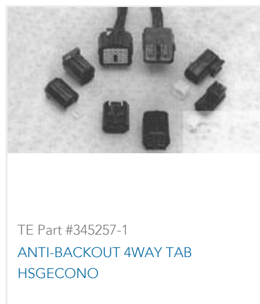
TE Part #345257-1 ANTI-BACKOUT 4WAY TAB HSGECONO