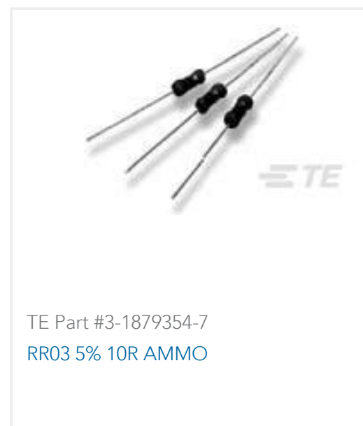
TE Part #3-1879354-7 RR03 5% 10R AMMO