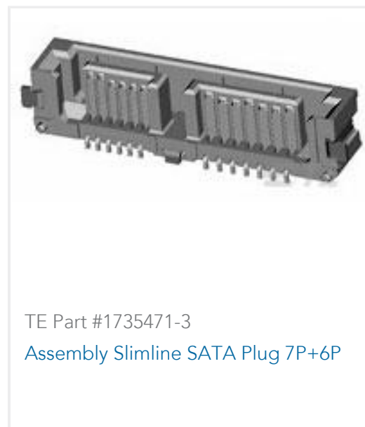
TE Part #1735471-3 Assembly Slimline SATA Plug 7P+6P