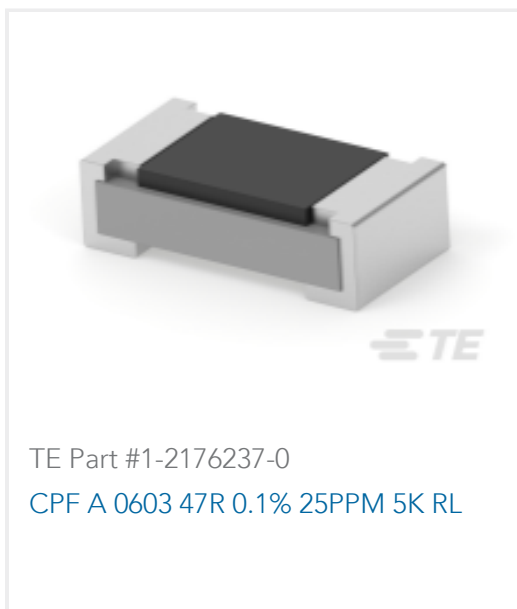
TE Part #1-2176237-0 CPF A 0603 47R 0.1% 25PPM 5K RL