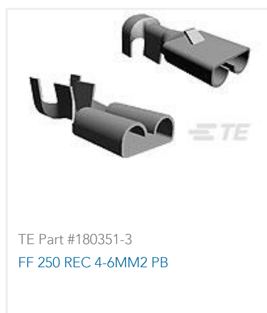
TE Part #180351-3 FF 250 REC 4-6MM2 PB