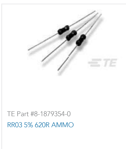
TE Part #8-1879354-0 RR03 5% 620R AMMO