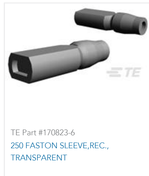
TE Part #170823-6 250 FASTON SLEEVE,REC., TRANSPARENT