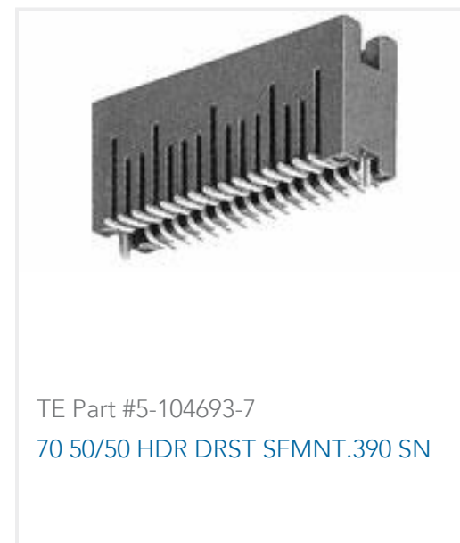
TE Part #5-104693-7 70 50/50 HDR DRST SFMNT.390 SN