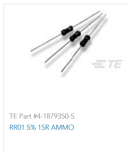
TE Part #4-1879350-5 RR01 5% 15R AMMO