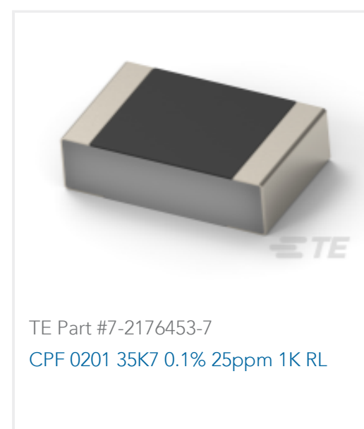
TE Part #7-2176453-7 CPF 0201 35K7 0.1% 25ppm 1K RL