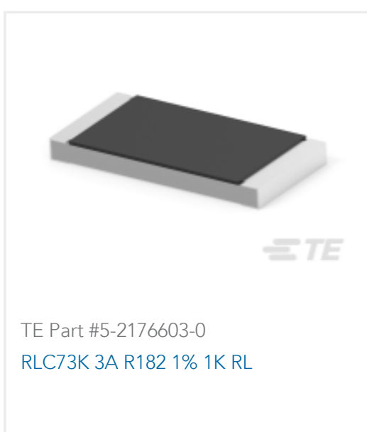
TE Part #5-2176603-0 RLC73K 3A R182 1% 1K RL