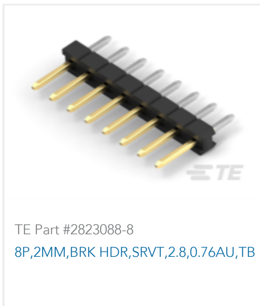
TE Part #2823088-8 8P,2MM,BRK HDR,SRVT,2.8,0.76AU,TB