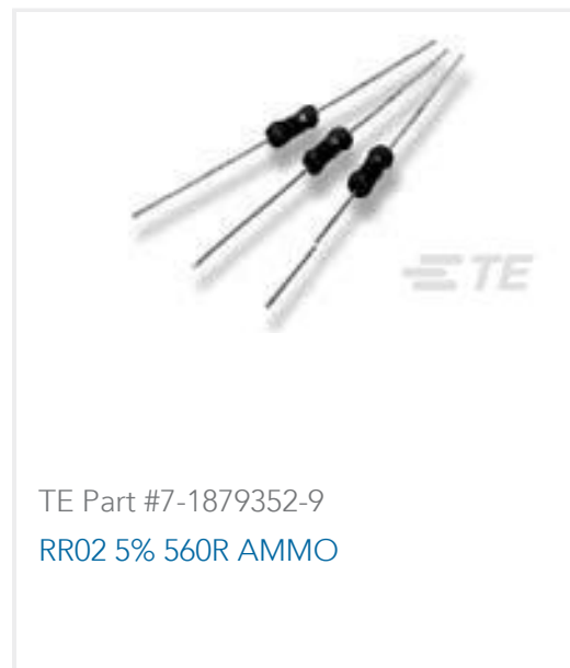
TE Part #7-1879352-9 RR02 5% 560R AMMO