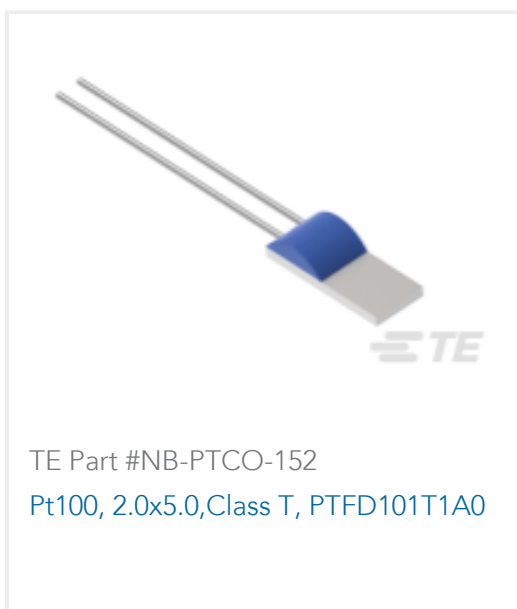
TE Part #NB-PTCO-152 Pt100, 2.0x5.0,Class T, PTFD101T1A0