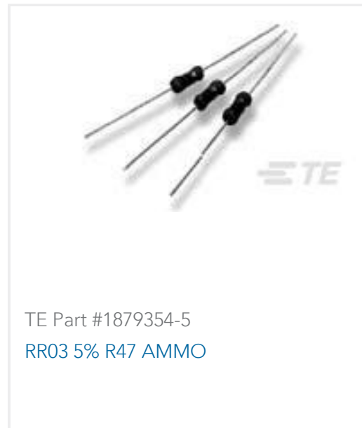
TE Part #1879354-5 RR03 5% R47 AMMO