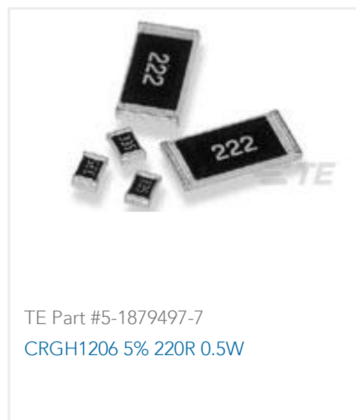
TE Part #5-1879497-7 CRGH1206 5% 220R 0.5W