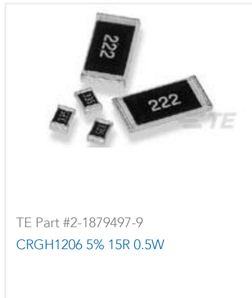
TE Part #2-1879497-9 CRGH1206 5% 15R 0.5W