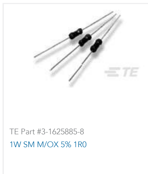
TE Part #3-1625885-8 1W SM M/OX 5% 1R0