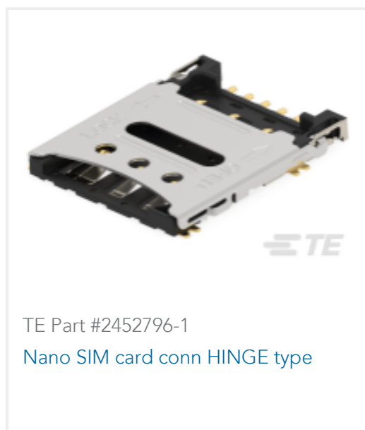
TE Part #2452796-1 Nano SIM card conn HINGE type