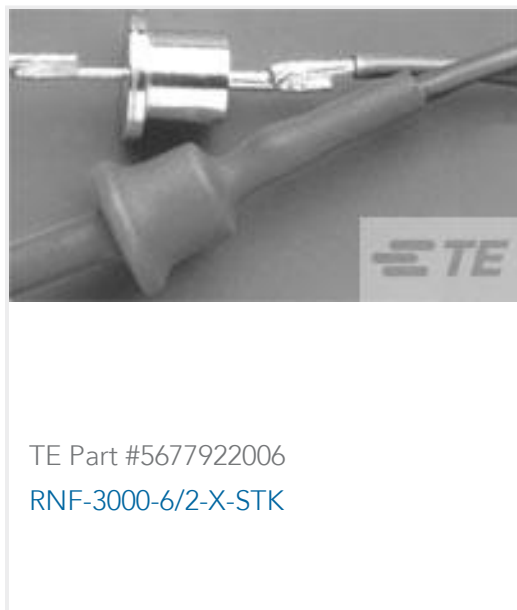
TE Part #5677922006 RNF-3000-6/2-X-STK