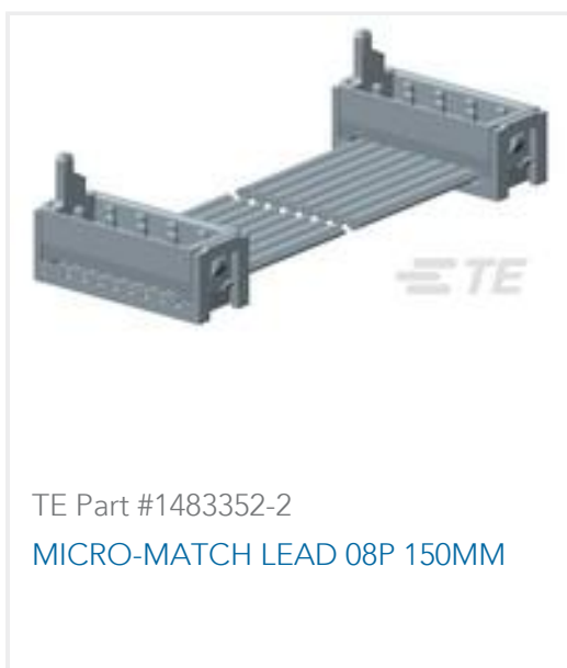
TE Part #1483352-2 MICRO-MATCH LEAD 08P 150MM