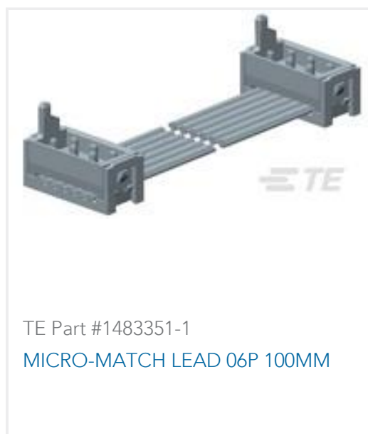
TE Part #1483351-1 MICRO-MATCH LEAD 06P 100MM