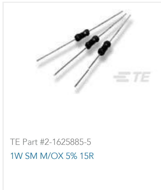
TE Part #2-1625885-5 1W SM M/OX 5% 15R