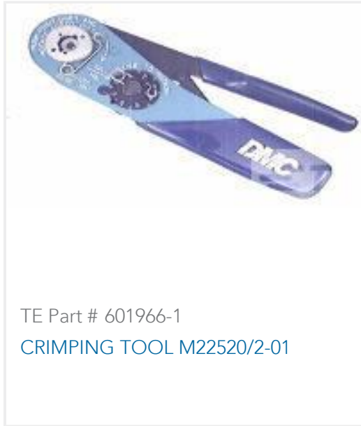
TE Part # 601966-1 CRIMPING TOOL M22520/2-01