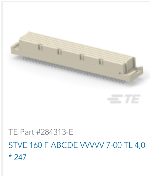
TE Part #284313-E STVE 160 F ABCDE VVVV 7-00 TL 4,0 * 247