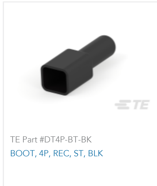
TE Part #DT4P-BT-BK BOOT, 4P, REC, ST, BLK