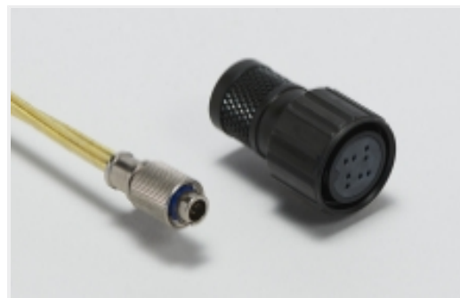
Standard Circular Connectors(4)