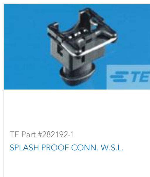
TE Part #282192-1 SPLASH PROOF CONN. W.S.L.