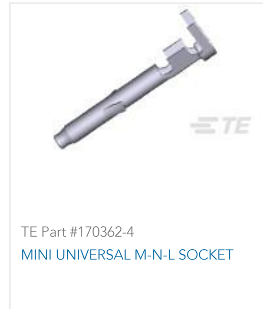
TE Part #170362-4 MINI UNIVERSAL M-N-L SOCKET