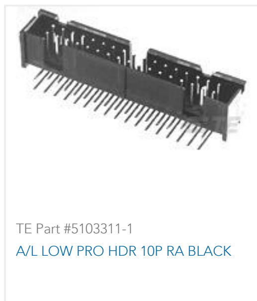
TE Part #5103311-1 A/L LOW PRO HDR 10P RA BLACK