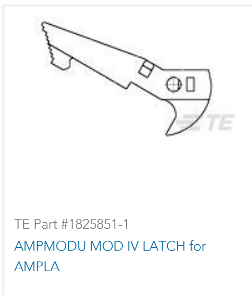
TE Part #1825851-1 AMPLA AMPMODU MOD IV LATCH for AMPLA