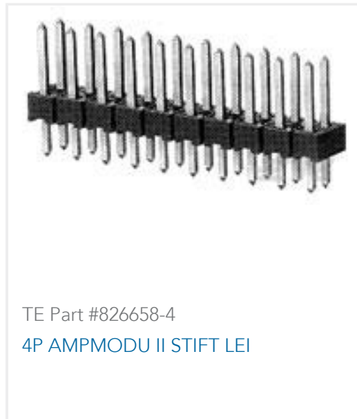
TE Part #826658-4 4P AMPMODU II STIFT LEI