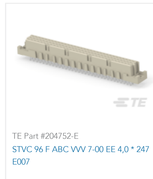
TE Part #204752-E STVC 96 F ABC VV 7-00 EE 4,0 * 247 E007