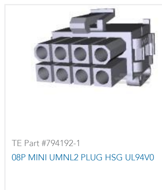
TE Part #794192-1 08P MINI UMN2 PLUG HSG UL94V0