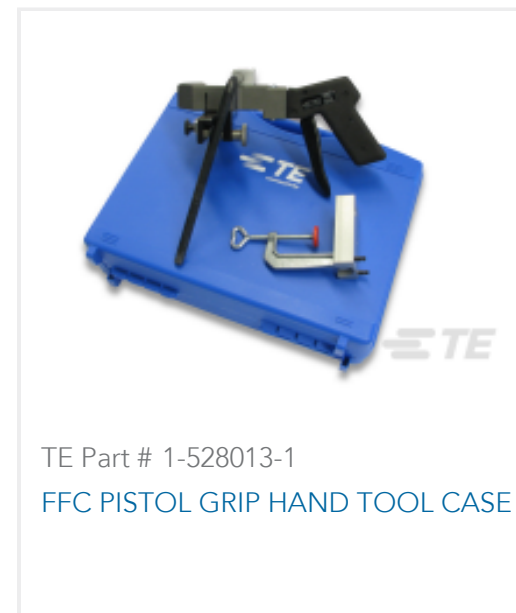
TE Part # 1-528013-1 FFC PISTOL GRIP HAND TOOL CASE