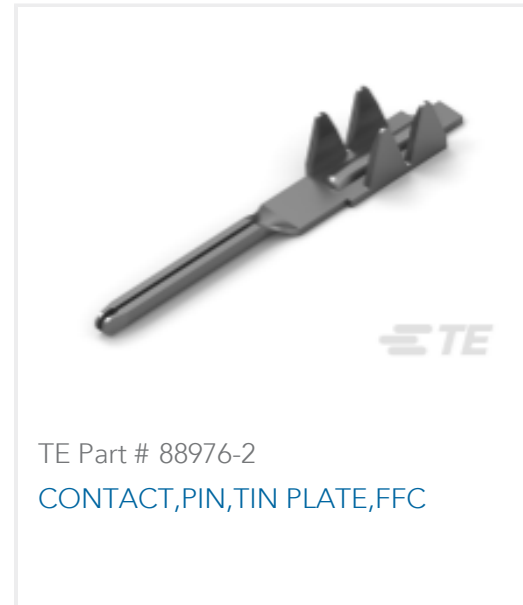
TE Part # 88976-2 CONTACT,PIN,TIN PLATE,FFC