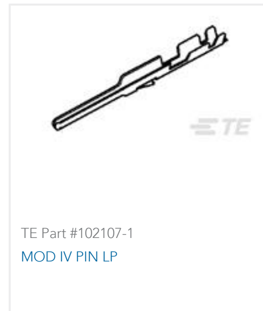
TE Part #102107-1 MOD IV PIN LP