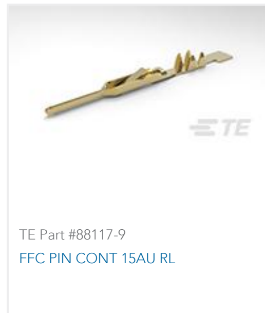
TE Part #88117-9 FFC PIN CONT 15AU RL