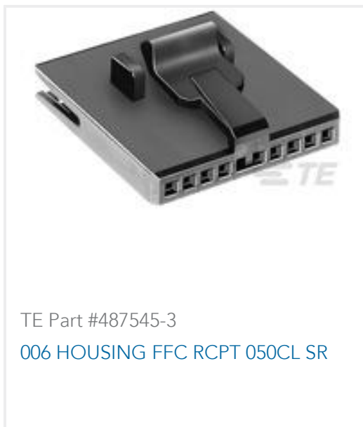
TE Part #487545-3 006 HOUSING FFC RCPT 050CL SR