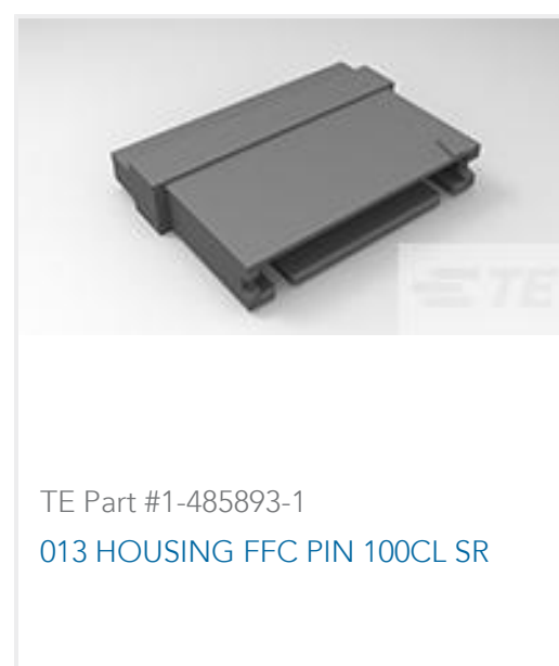
TE Part #1-485893-1 013 HOUSING FFC PIN 100CL SR