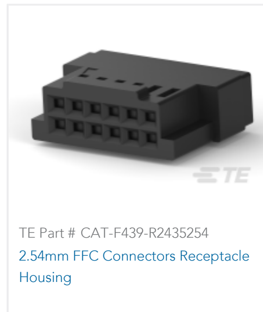
TE Part # CAT-F439-R2435254 2.54mm FFC Connectors Receptacle Housing