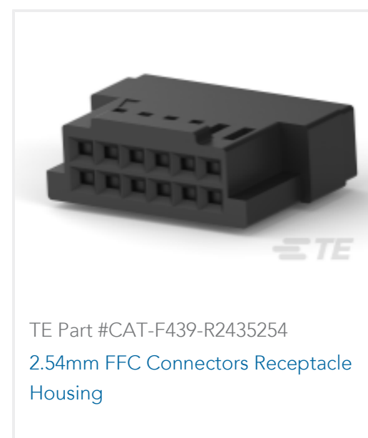
TE Part #CAT-F439-R2435254 2.54mm FFC Connectors Receptacle Housing