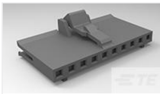
TE Part # 1-487526-8 019 HOUSING FFC RCPT 100CL SR