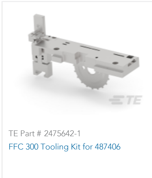
TE Part # 2475642-1 FFC 300 Tooling Kit for 487406