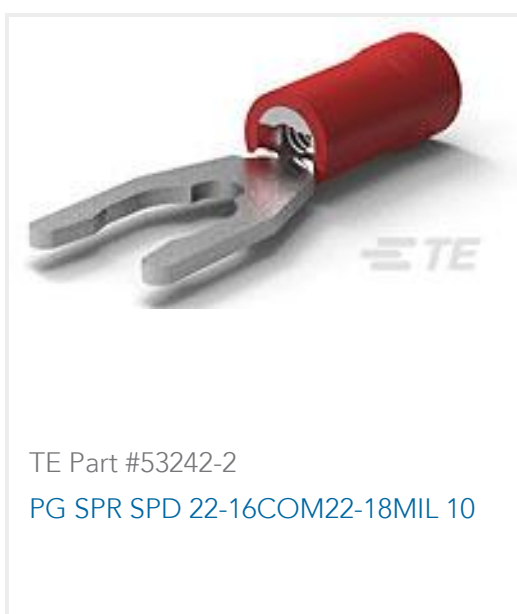
TE Part #53242-2 PG SPR SPD 22-16COM22-18MIL 10