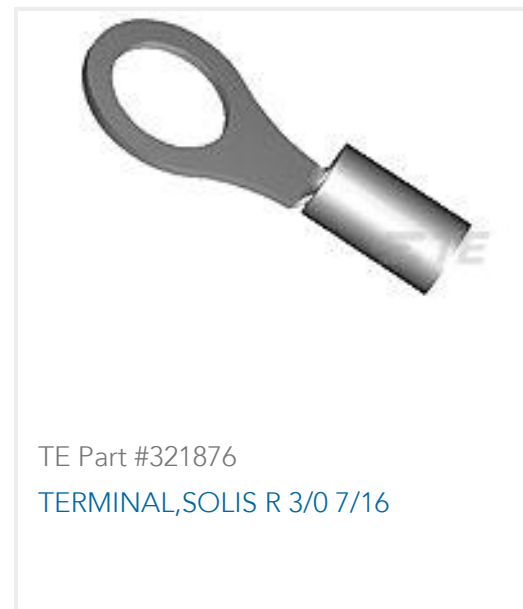
TE Part #321876 TERMINAL,SOLIS R 3/0 7/16