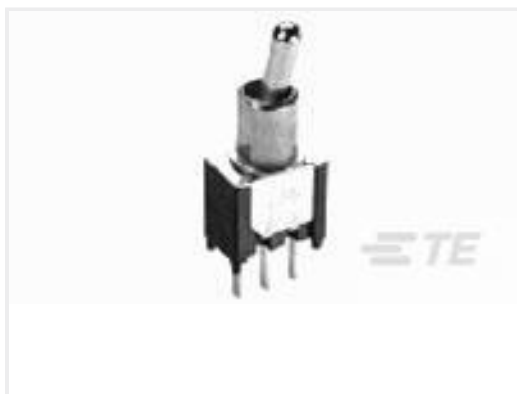
TE Part #1437562-3 TT21NGPC1=SW TOGGLE W/GOLD PC