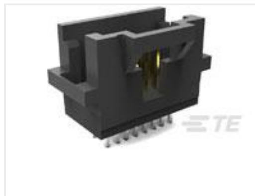
TE Part #6-104068-3 34 SYSTEM 50 HDR DRST SHRD