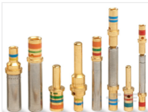
TE Part # 4109-207-2000L CONT SOC ASSY