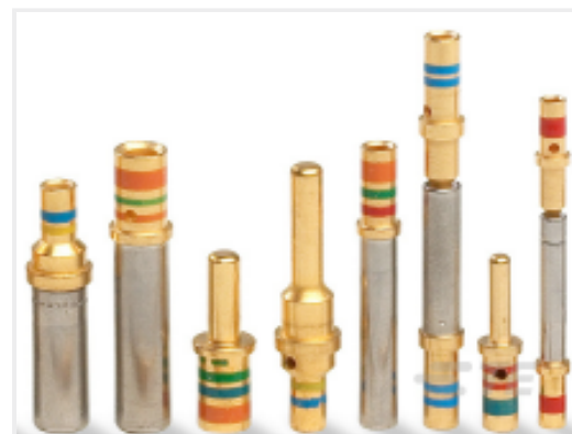
TE Part #4109-207-2000L CONT SOC ASSY