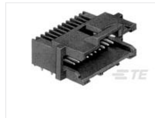
TE Part #6-104069-7 100 sys 50 hdr drra shrd sn