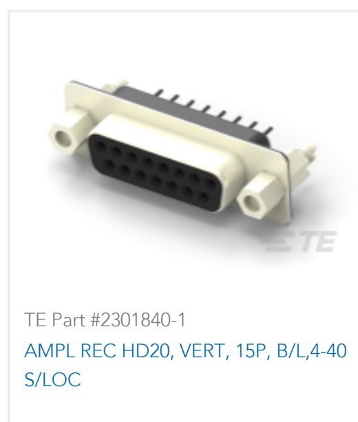
TE Part #2301840-1 AMPL REC HD20, VERT, 15P, B/L,4-40 S/LOC