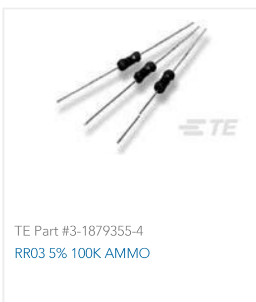
TE Part #3-1879355-4 RR03 5% 100K AMMO