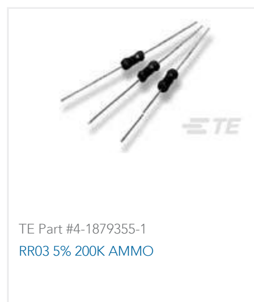
TE Part #4-1879355-1 RR03 5% 200K AMMO