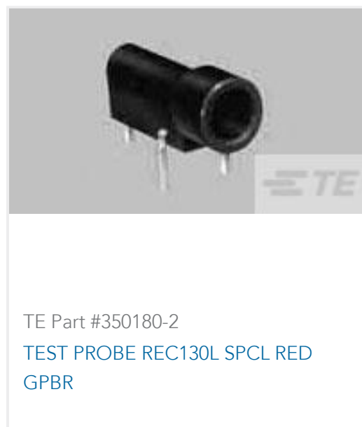
TE Part #350180-2 TEST PROBE REC130L SPCL RED GPBR