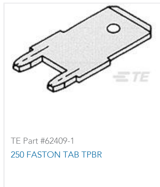
TE Part #62409-1 250 FASTON TAB TPBR