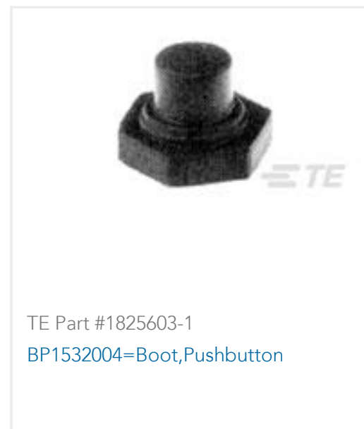
TE Part #1825603-1 BP1532004=Boot,Pushbutton GPBR