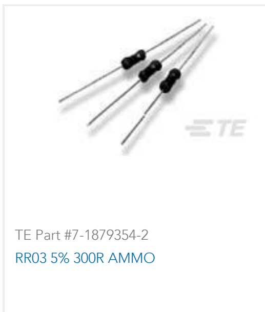
TE Part #7-1879354-2 RR03 5% 300R AMMO