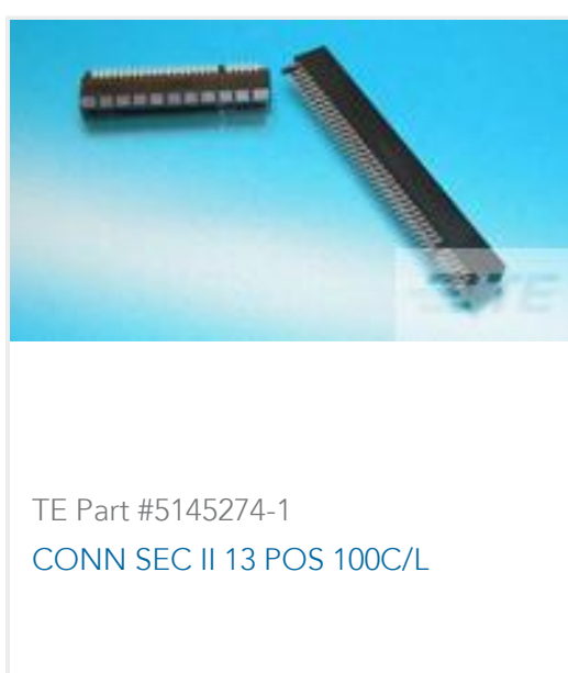
TE Part #5145274-1 CONN SEC II 13 POS 100C/L