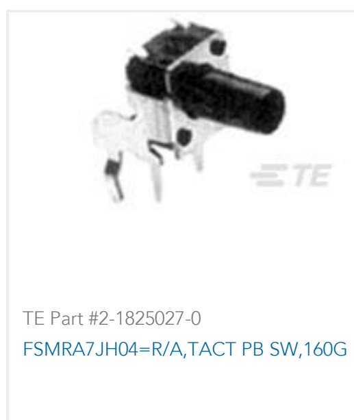
TE Part #2-1825027-0 FSMRA7JH04=R/A,TACT PB SW,160G