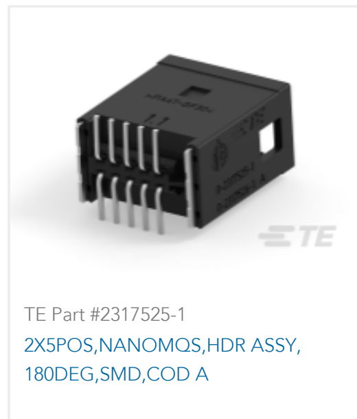
TE Part #2317525-1 2X5POS,NANOMQS,HDR ASSY, 180DEG,SMD,COD A