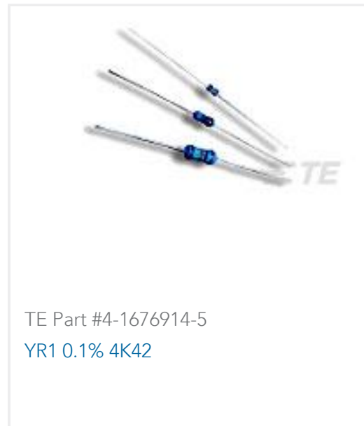
TE Part #4-1676914-5 YR1 0.1% 4K42