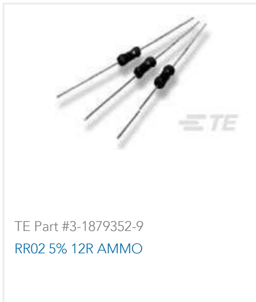
TE Part #3-1879352-9 RR02 5% 12R AMMO