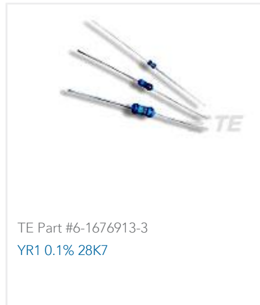
TE Part #6-1676913-3 YR1 0.1% 28K7