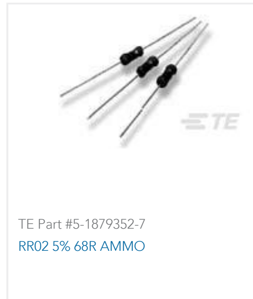
TE Part #5-1879352-7 RR02 5% 68R AMMO