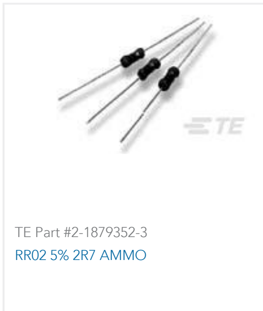
TE Part #2-1879352-3 RR02 5% 2R7 AMMO