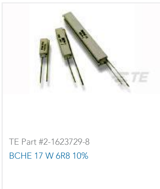
TE Part #2-1623729-8 BCHE 17 W 6R8 10%