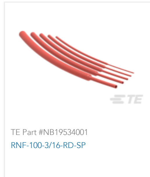
TE Part #NB19534001 RNF-100-3/16-RD-SP