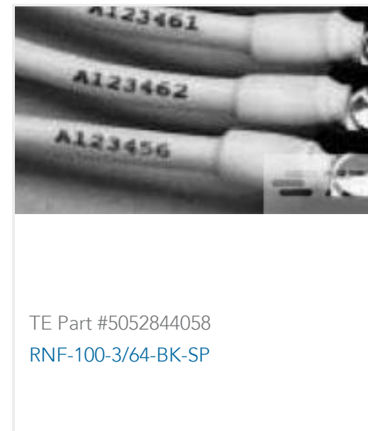
TE Part #5052844058 RNF-100-3/64-BK-SP