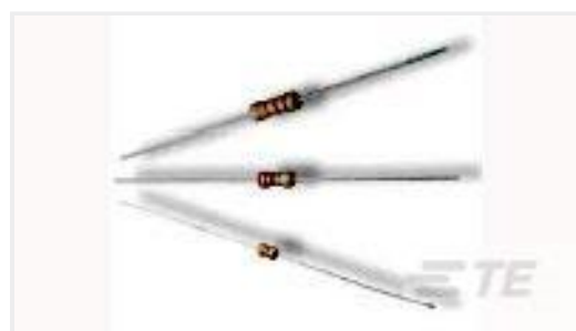
TE Part #2-1623925-1 CFR100 5% 220K