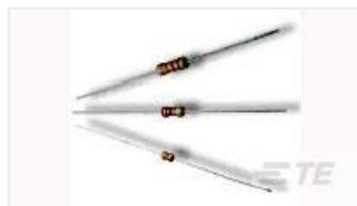
TE Part #4-1623932-5 CFR50 5% 1M0