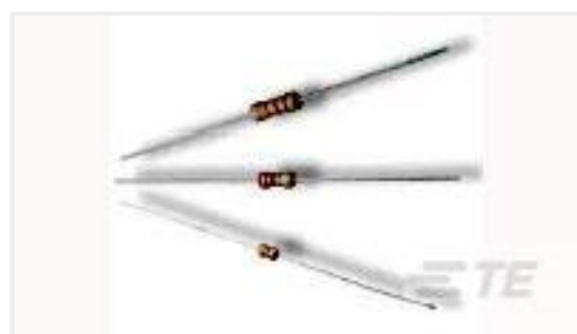
TE Part #3-1623925-9 CFR100 5% 470R