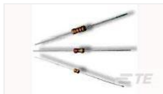
TE Part #4-1623925-2 CFR100 5% 4K7