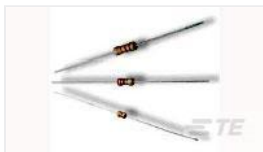
TE Part #1623925-3 CFR100 5% 10K