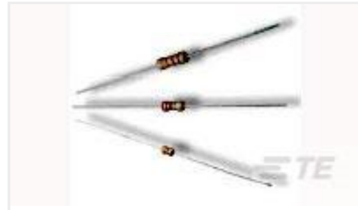
TE Part #3-1623925-8 CFR100 5% 470K