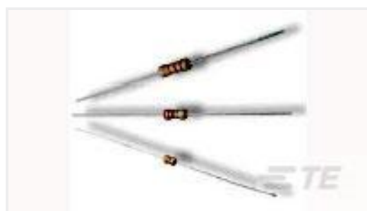
TE Part #1-1623925-9 CFR100 5% 1M0