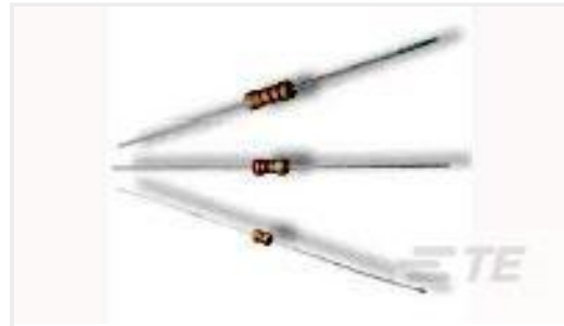
TE Part # 1623932-8 CFR50 5% 10K