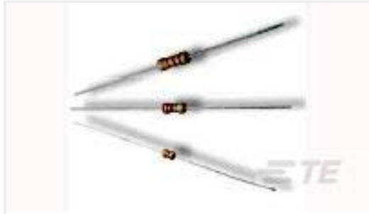
TE Part # 1623925-2 CFR100 5% 100R