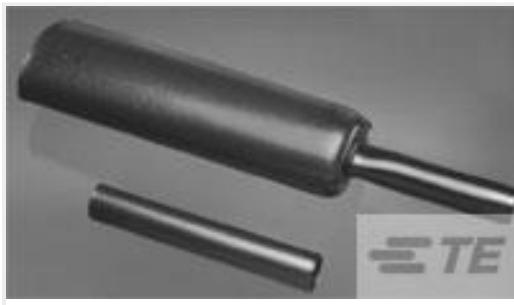
TE Part #397892-000 RMW-16/5-1200/ADH-0