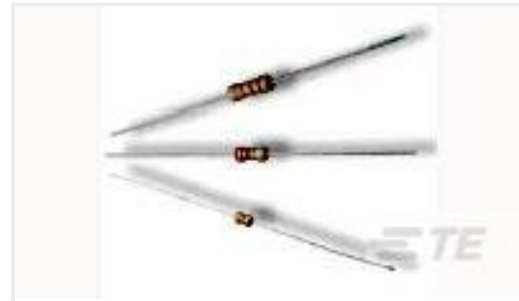
TE Part # 1623927-8 CFR16 5% 120R