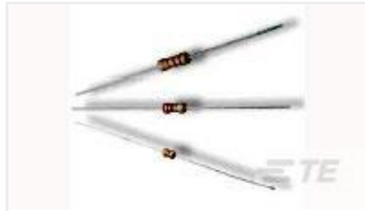
TE Part # 2-1623929-2 CFR200 5% 22K