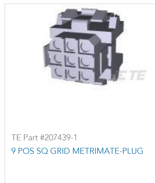
TE Part #207439-1 9 POS SQ GRID METRIMATE-PLUG