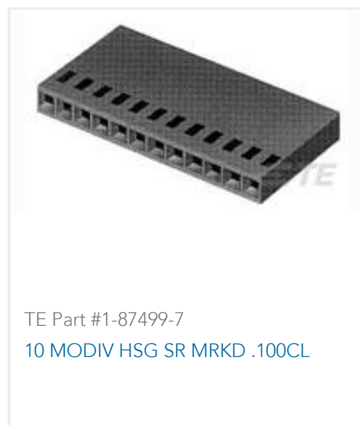
TE Part #1-87499-7 10 MODIV HSG SR MRKD .100CL