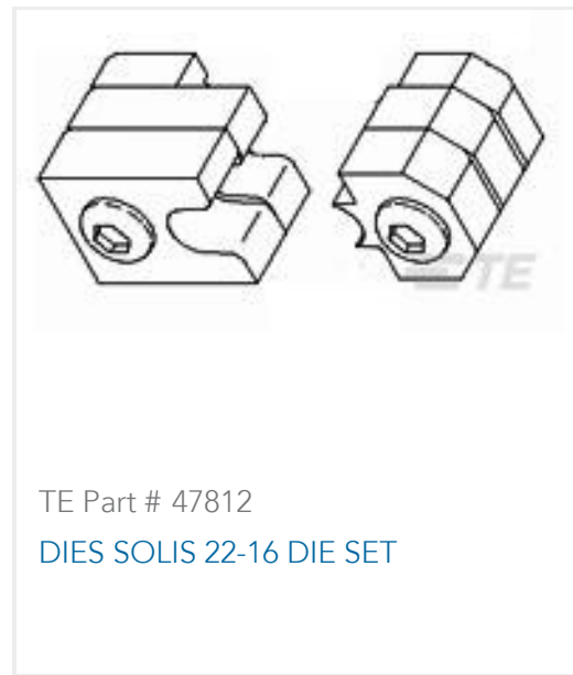
TE Part # 47812 DIES SOLIS 22-16 DIE SET