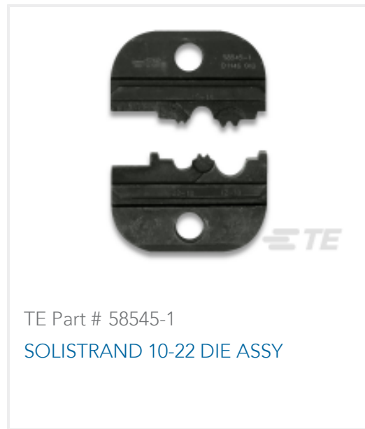
TE Part # 58545-1 SOLISTRAND 10-22 DIE ASSY