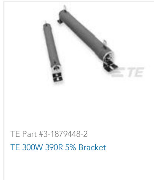
TE Part #3-1879448-2 TE 300W 390R 5% Bracket