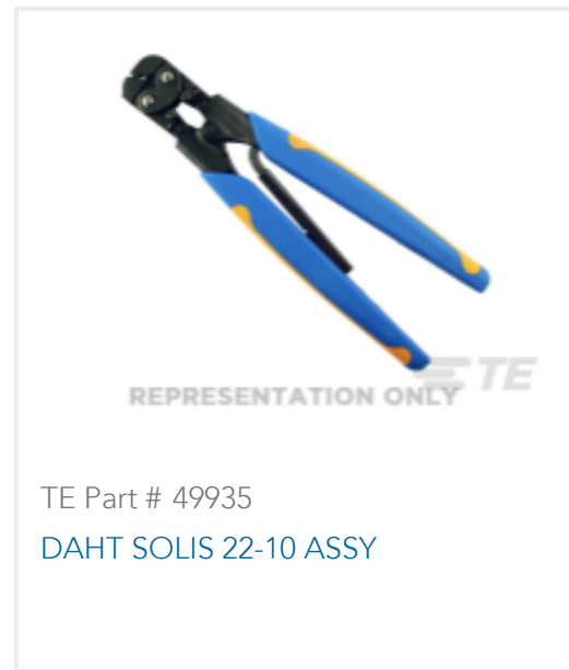
TE Part # 49935 DAHT SOLIS 22-10 ASSY