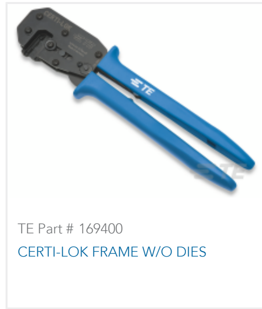
TE Part # 169400 CERTI-LOK FRAME W/O DIES