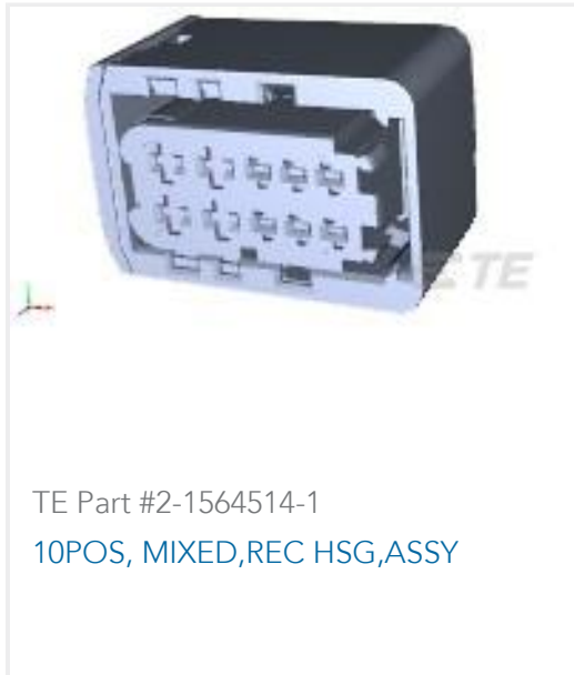
TE Part #2-1564514-1 10POS, MIXED, REC HSG, ASSY