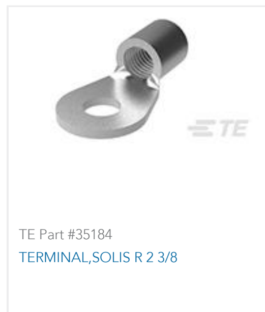
TE Part #35184 TERMINAL,SOLIS R 2 3/8