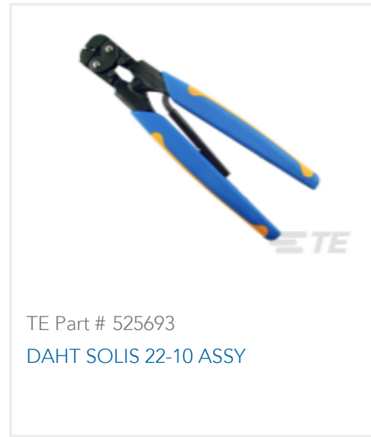
TE Part # 525693 DAHT SOLIS 22-10 ASSY