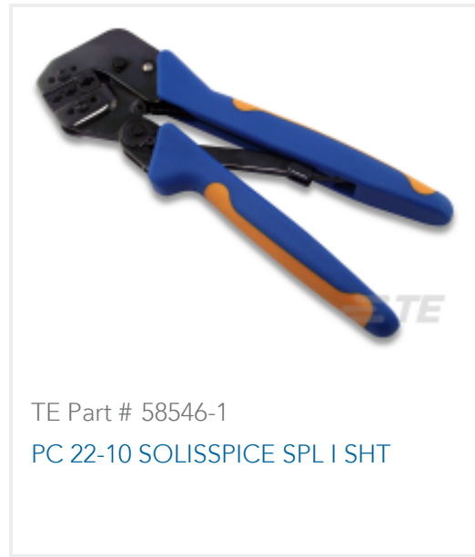
TE Part # 58546-1 PC 22-10 SOLISSPICE SPL I SHT