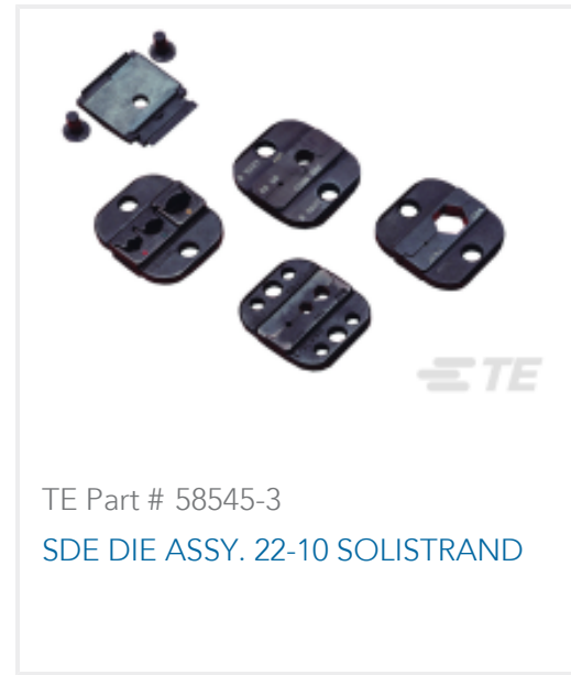
TE Part # 58545-3 SDE DIE ASSY. 22-10 SOLISTRAND