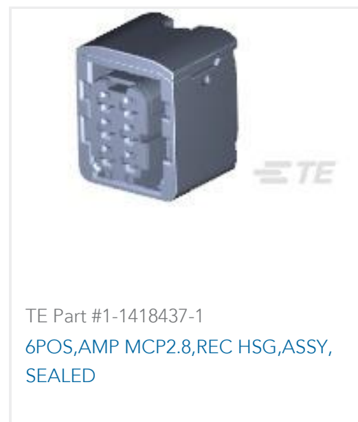
TE Part #1-1418437-1 6POS,AMP MCP2.8,REC HSG,ASSY, SEALED