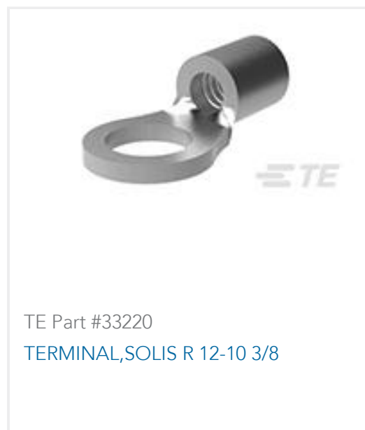
TE Part #33220 TERMINAL,SOLIS R 12-10 3/8