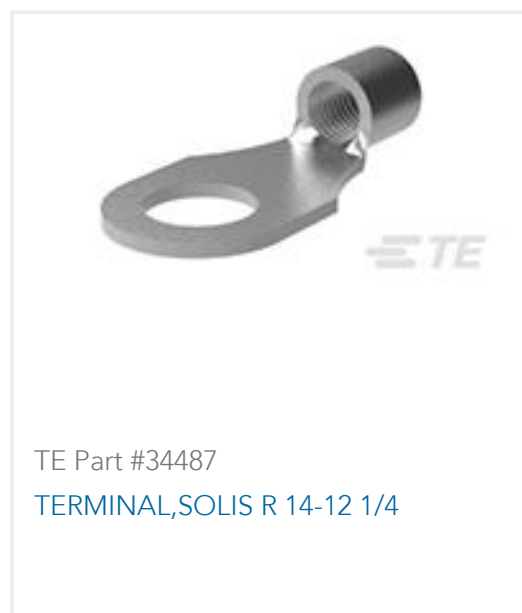
TE Part #34487 TERMINAL,SOLIS R 14-12 1/4