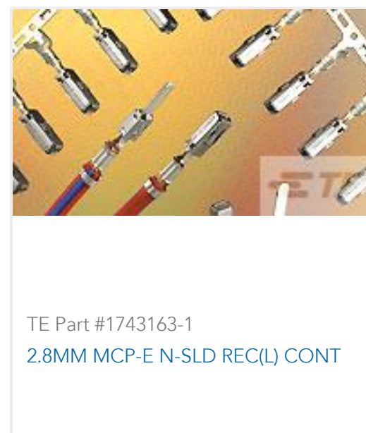
TE Part #1743163-1 2.8MM MCP-E N-SLD REC(L) CONT