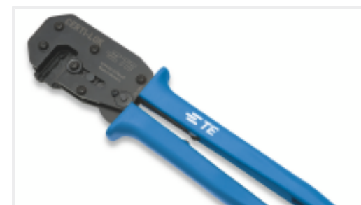
TE Part # 169400 CERTI-LOK FRAME W/O DIES