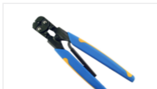
TE Part # 49935 DAHT SOLIS 22-10 ASSY