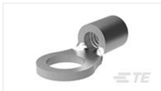
TE Part #34124 TERMINAL,SOLIS R 16-14 1/4