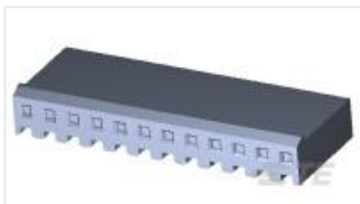
TE Part #1-640250-2 12P SL156 HSG W/LCK RAMP NATL