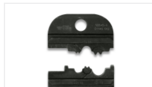
TE Part # 58545-1 SOLISTRAND 10-22 DIE ASSY