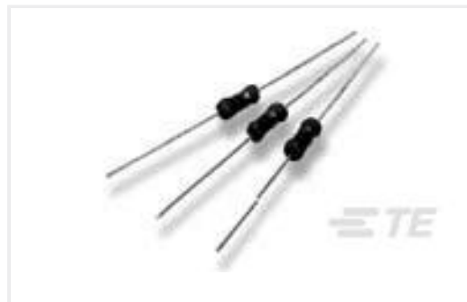
TE Part #3-1879351-9 RR01 5% 110K AMMO