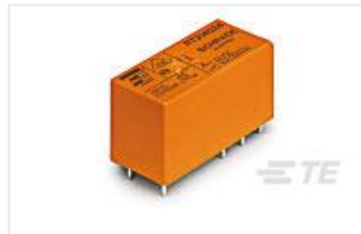
TE Part #8-1393239-8 RT314F24