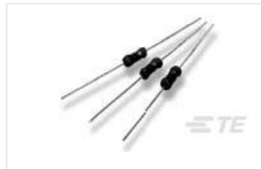
TE Part #3-1879355-4 RR03 5% 100K AMMO