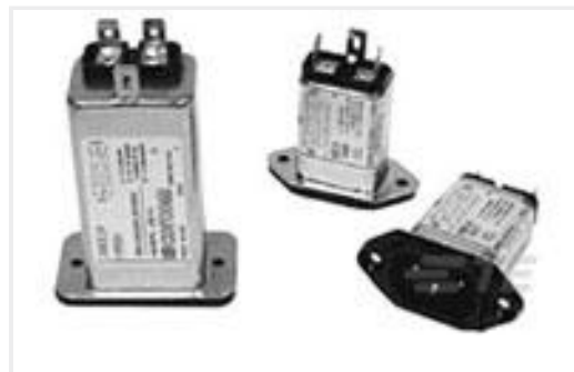
TE Part #1-6609006-7 15EEJ1=F8021 S0