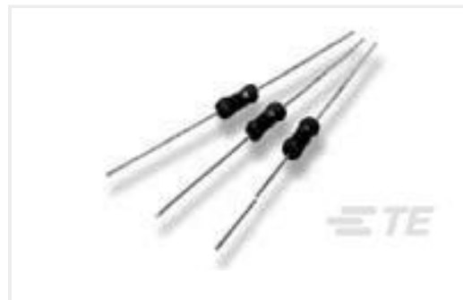
TE Part #2-1879352-5 RR02 5% 3R3 AMMO