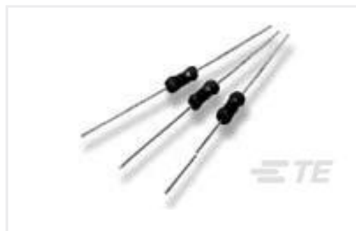
TE Part #1879351-6 RR01 5% 4K7 AMMO