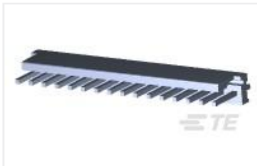
TE Part #1-640445-6 16P MTA156 HDR ASSY FL/STR SN