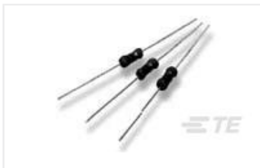
TE Part #4-1879355-0 RR03 5% 180K AMMO