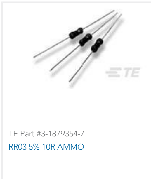
TE Part #3-1879354-7 RR03 5% 10R AMMO