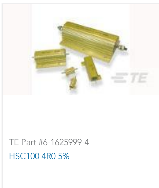
TE Part #6-1625999-4 HSC100 4R0 5%