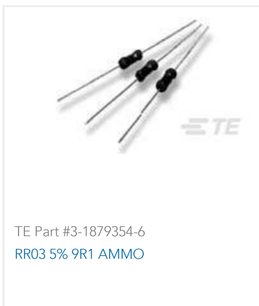
TE Part #3-1879354-6 RR03 5% 9R1 AMMO