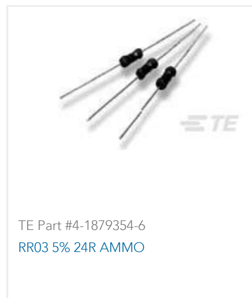
TE Part #4-1879354-6 RR03 5% 24R AMMO