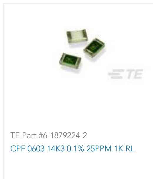
TE Part #6-1879224-2 CPF 0603 14K3 0.1% 25PPM 1K RL