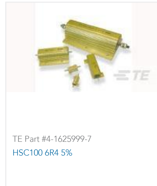
TE Part #4-1625999-7 HSC100 6R4 5%