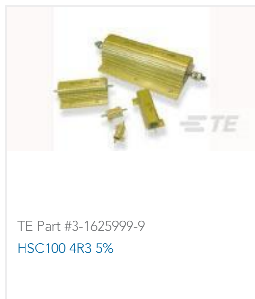
TE Part #3-1625999-9 HSC100 4R3 5%