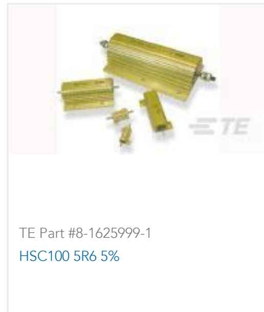
TE Part #8-1625999-1 HSC100 5R6 5%