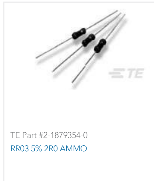
TE Part #2-1879354-0 RR03 5% 2R0 AMMO