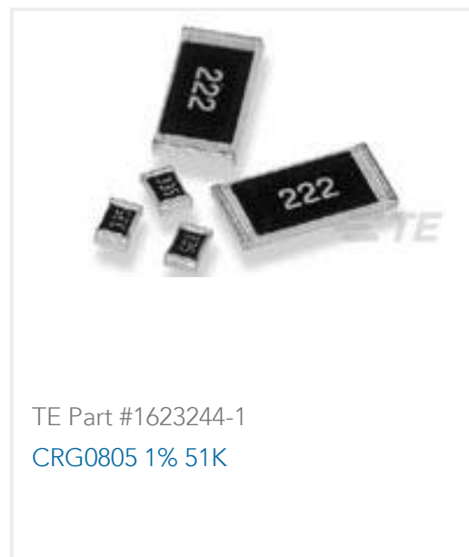
TE Part #1623244-1 CRG0805 1% 51K