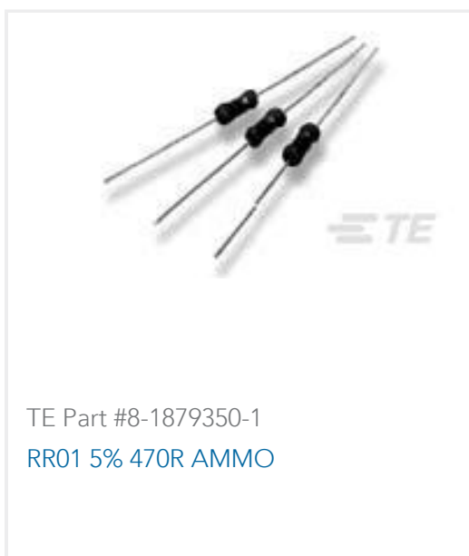
TE Part #8-1879350-1 RR01 5% 470R AMMO