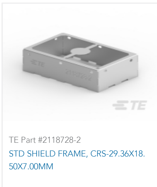
TE Part #2118728-2 STD SHIELD FRAME, CRS-29.36X18.50X7.00MM