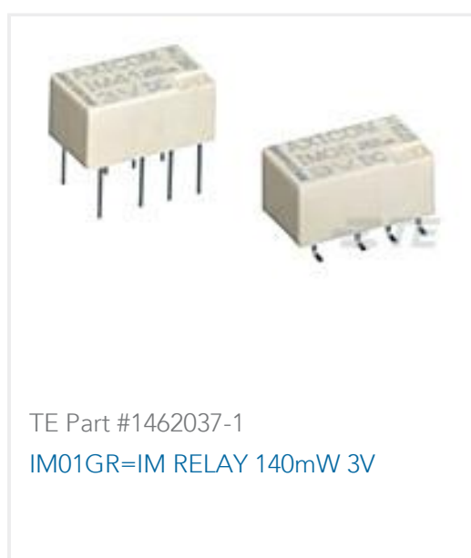
TE Part #1462037-1 IM01GR=IM RELAY 140mW 3V