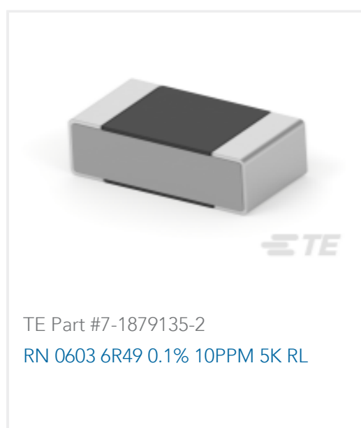
TE Part #7-1879135-2 RN 0603 6R49 0.1% 10PPM 5K RL