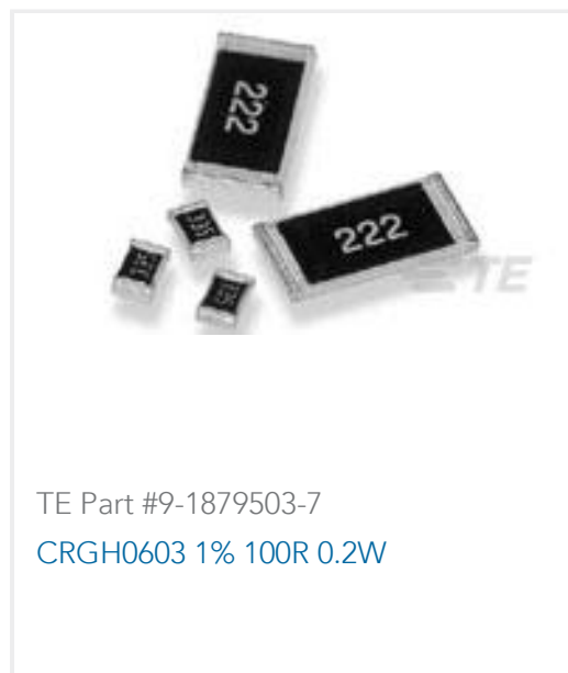
TE Part #9-1879503-7 CRGH0603 1% 100R 0.2W