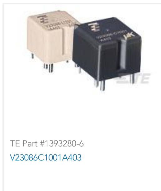
TE Part #1393280-6 V23086C1001A403