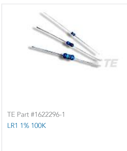
TE Part #1622296-1 LR1 1% 100K