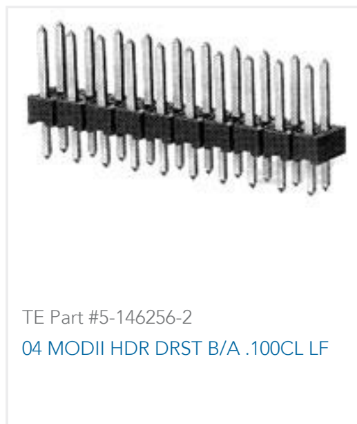
TE Part #5-146256-2 04 MODII HDR DRST B/A .100CL LF