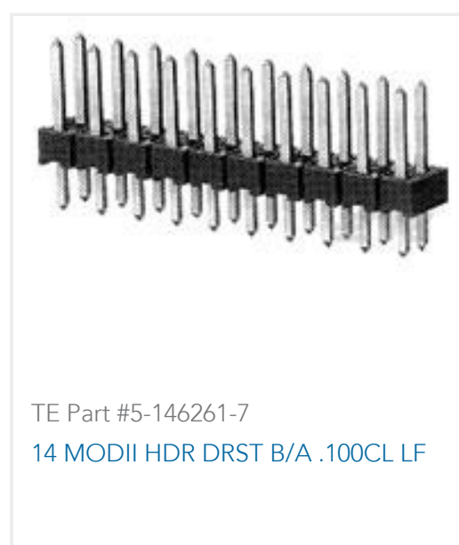
TE Part #5-146261-7 14 MODII HDR DRST B/A .100CL LF