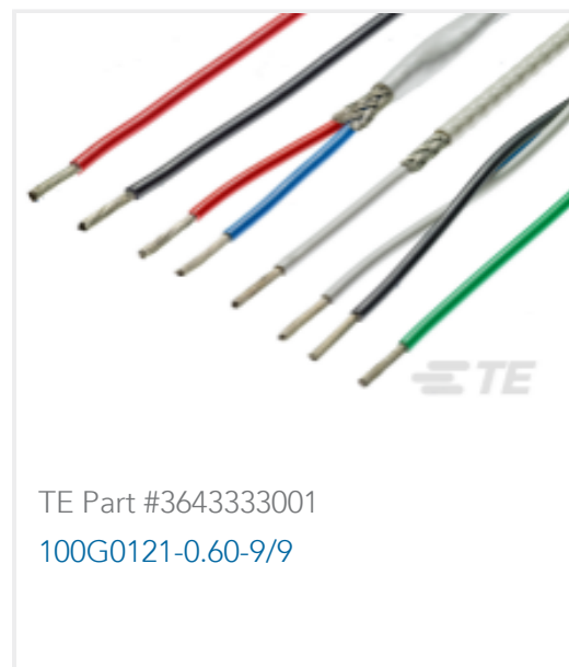
TE Part #3643333001 100G0121-0.60-9/9