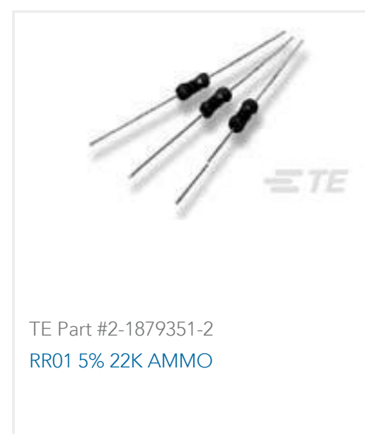
TE Part #2-1879351-2 RR01 5% 22K AMMO