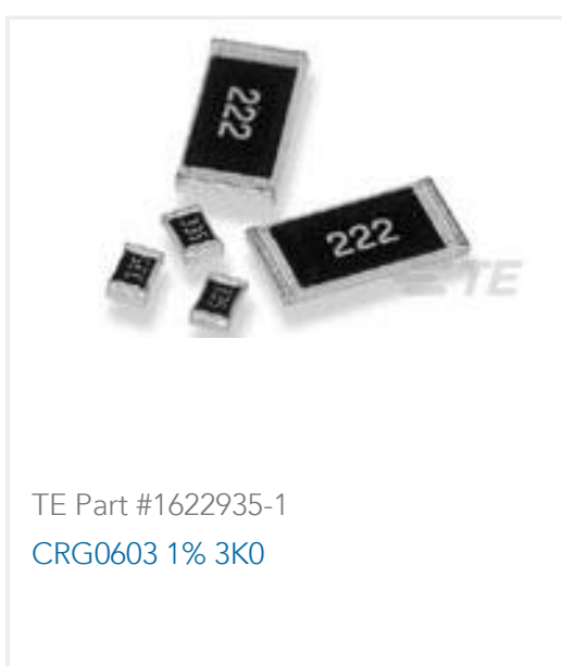
TE Part #1622935-1 CRG0603 1% 3K0