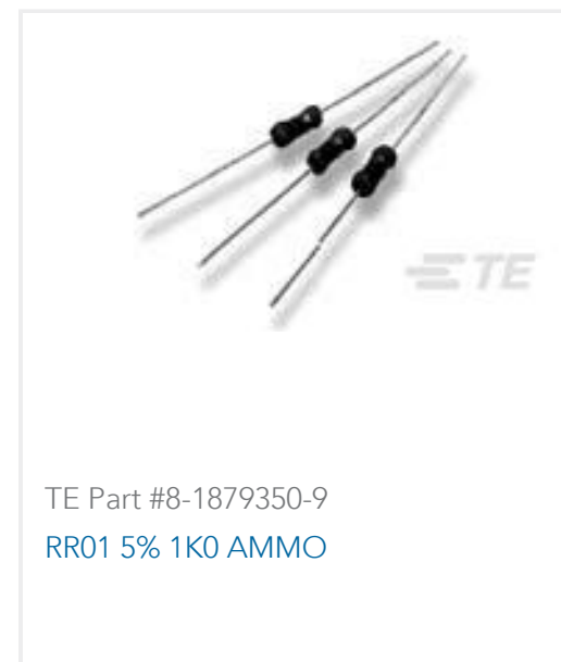
TE Part #8-1879350-9 RR01 5% 1K0 AMMO