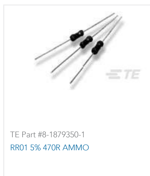
TE Part #8-1879350-1 RR01 5% 470R AMMO