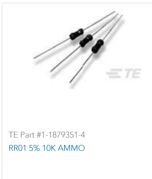
TE Part #1-1879351-4 RR01 5% 10K AMMO