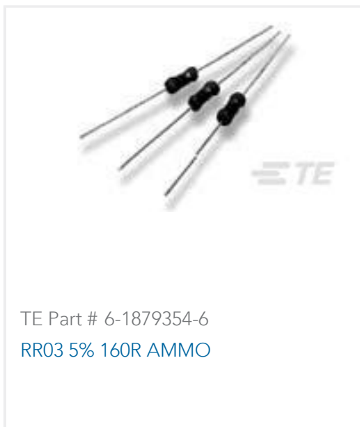
TE Part # 6-1879354-6 RR03 5% 160R AMMO