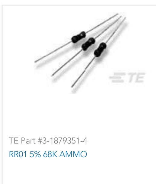
TE Part #3-1879351-4 RR01 5% 68K AMMO