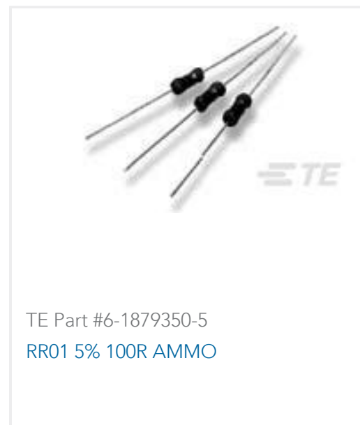
TE Part #6-1879350-5 RR01 5% 100R AMMO