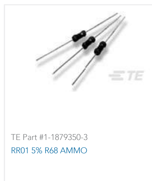
TE Part #1-1879350-3 RR01 5% R68 AMMO