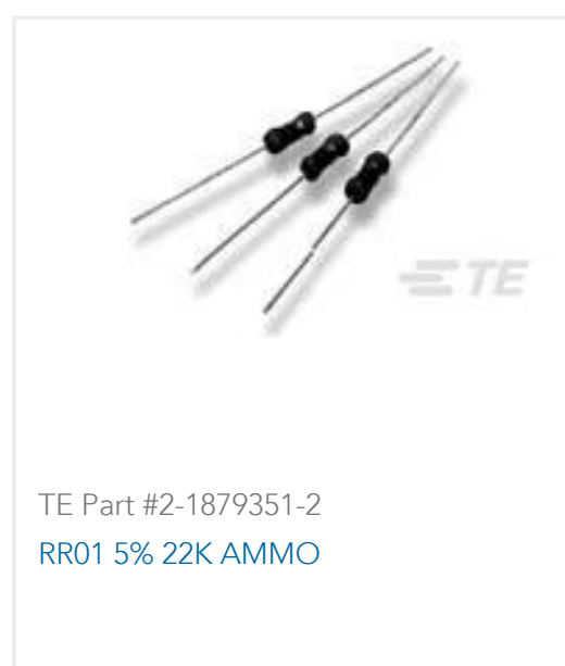
TE Part #2-1879351-2 RR01 5% 22K AMMO