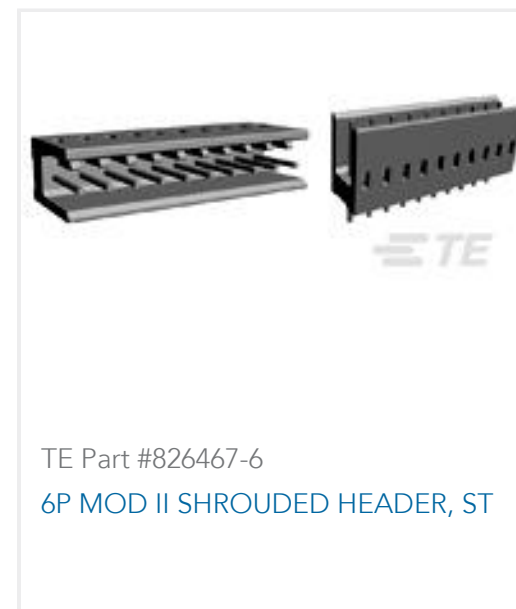
TE Part #826467-6 6P MOD II SHROUDED HEADER, ST