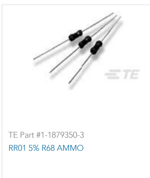
TE Part #1-1879350-3 RR01 5% R68 AMMO