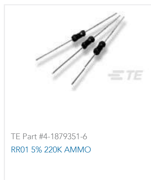
TE Part #4-1879351-6 RR01 5% 220K AMMO