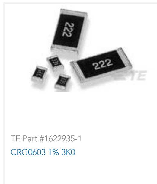
TE Part #1622935-1 CRG0603 1% 3K0