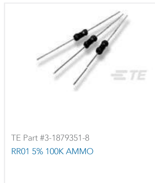
TE Part #3-1879351-8 RR01 5% 100K AMMO