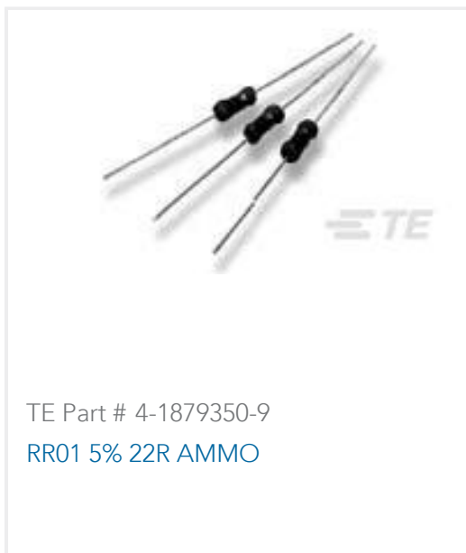
TE Part # 4-1879350-9 RR01 5% 22R AMMO