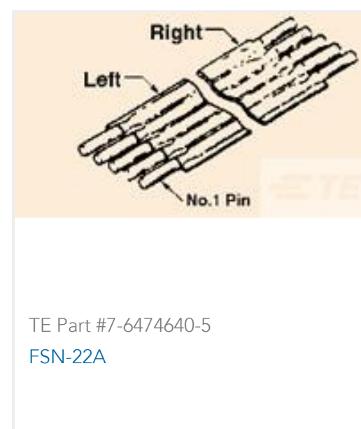
TE Part #7-6474640-5 FSN-22A