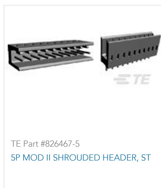
TE Part #826467-5 5P MOD II SHROUDED HEADER, ST