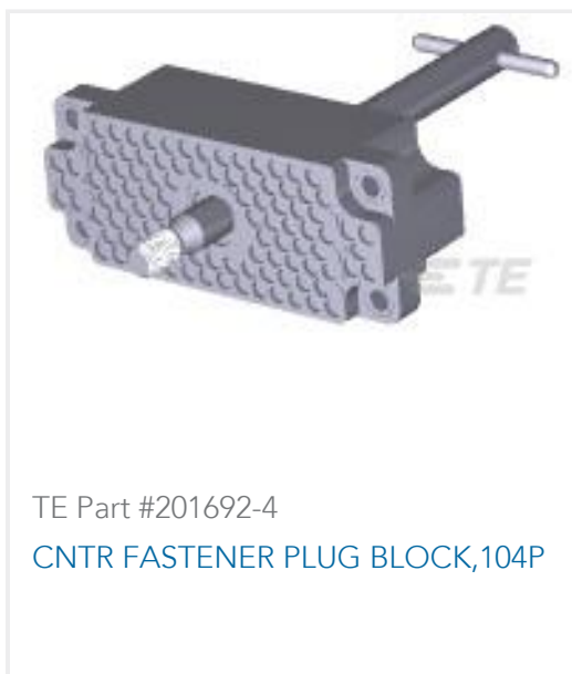
TE Part #201692-4 CNTR FASTENER PLUG BLOCK,104P