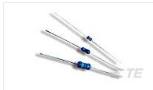
TE Part #7-1879026-4 YR1 0.1% 40R2