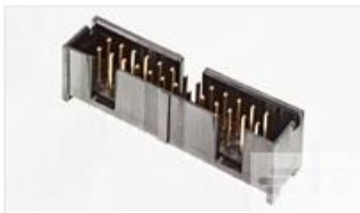
TE Part #1-5103308-0 A/L LOW PRO HDR 50P VERT BLACK