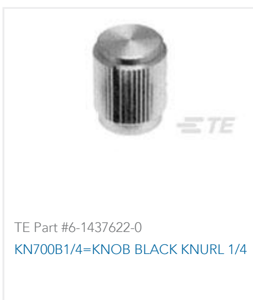
TE Part #6-1437622-0 KN700B1/4=KNOB BLACK KNURL 1/4