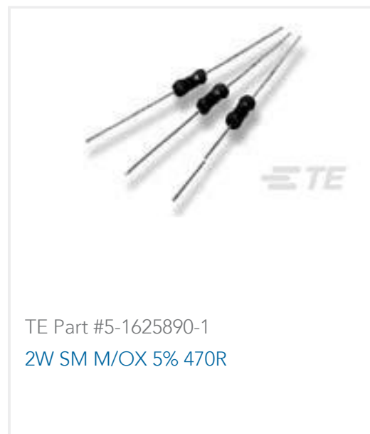
TE Part #5-1625890-1 2W SM M/OX 5% 470R