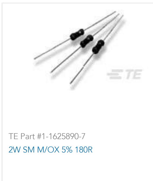
TE Part #1-1625890-7 2W SM M/OX 5% 180R