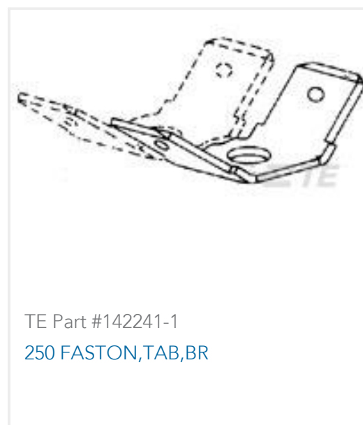
TE Part #142241-1 250 FASTON,TAB,BR