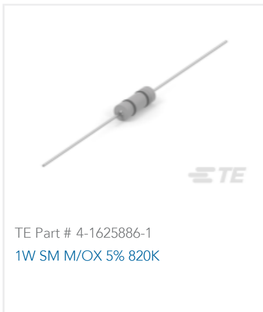
TE Part # 4-1625886-1 1W SM M/OX 5% 820K