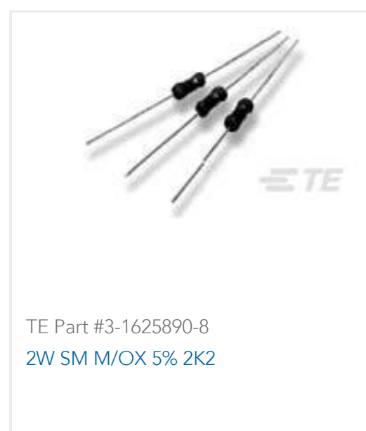
TE Part #3-1625890-8 2W SM M/OX 5% 2K2