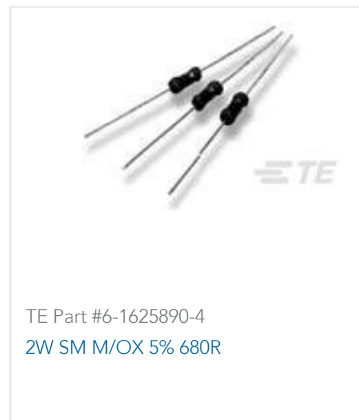
TE Part #6-1625890-4 2W SM M/OX 5% 680R