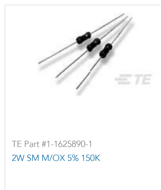
TE Part #1-1625890-1 2W SM M/OX 5% 150K