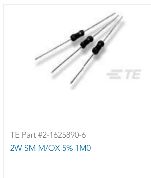
TE Part #2-1625890-6 2W SM M/OX 5% 1M0