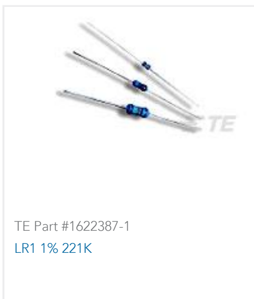
TE Part #1622387-1 LR1 1% 221K