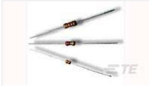
TE Part # 1623927-8 CFR16 5% 120R