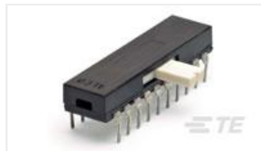
TE Part #4-1825010-2 ASE62L04=6PDT AUTOSLIDE