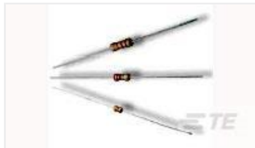
TE Part #1623925-1 CFR100 5% 100K