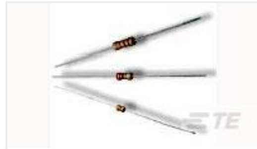
TE Part # 1623932-8 CFR50 5% 10K