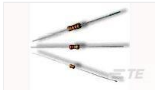
TE Part #1623925-3 CFR100 5% 10K