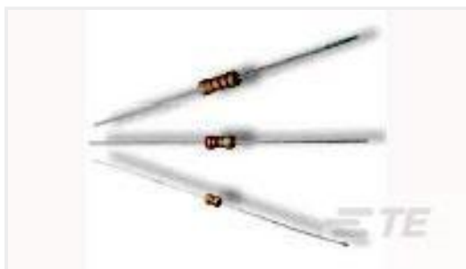
TE Part #4-1623925-2 CFR100 5% 4K7