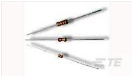
TE Part #1-1623925-5 CFR100 5% 1K0