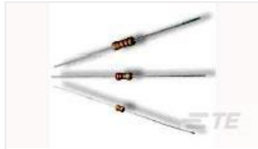
TE Part # 2-1623929-2 CFR200 5% 22K