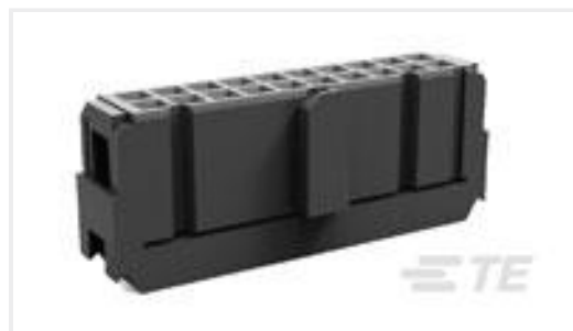
TE Part #1658621-8 34 NOVO MIL/CTR 15DP, LEAD FREE