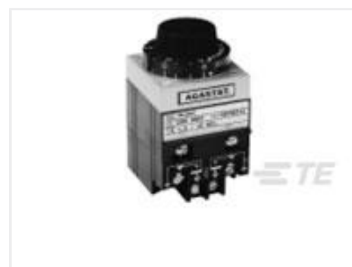
TE Part #3-1423159-1 7012PH=RLY,STD,ON,2P,125VDC,30