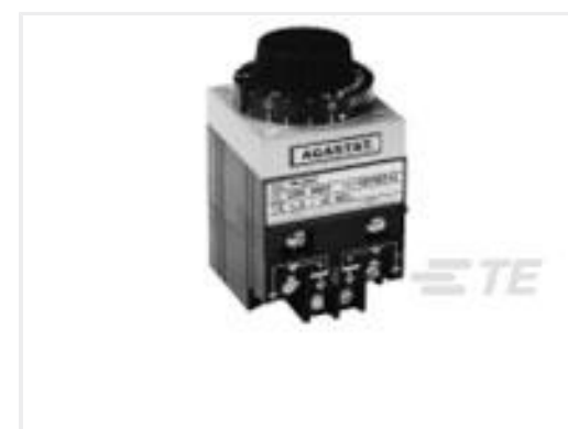
TE Part #2-1423157-0 7012AH=RLY,STD,ON,2P,120VAC,30