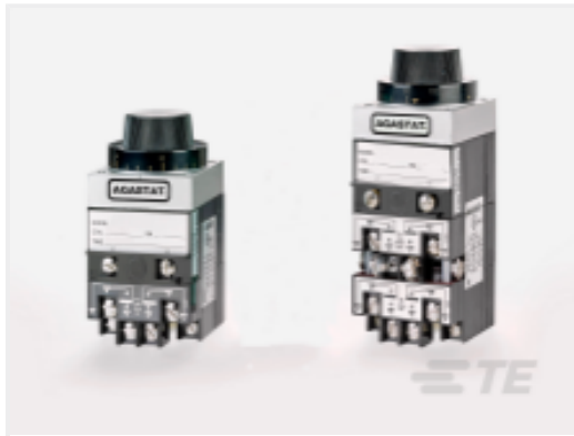
TE Part # 2-1423157-4 7012AK=RLY,STD,ON,2P,120VAC,30