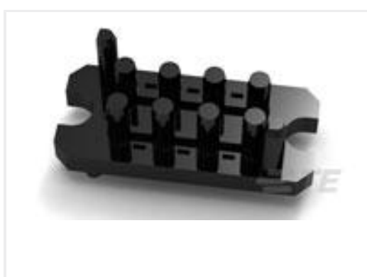
TE Part #1648128-1 235-0153-01100=SKT,MARKED