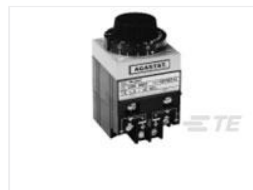
TE Part #2-1423164-2 7022PD=RLY,STD,OFF,2P,125VDC,5