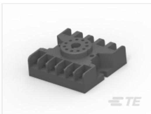
TE Part #1393143-7 27E123=SOCKET,KRP,11,SCW,SURF-MOUNT