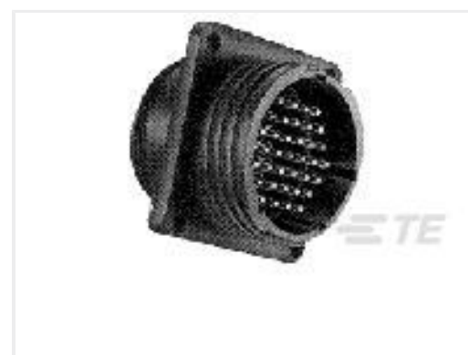
TE Part #206036-1 RECEPT,SZ 17-16 CPC