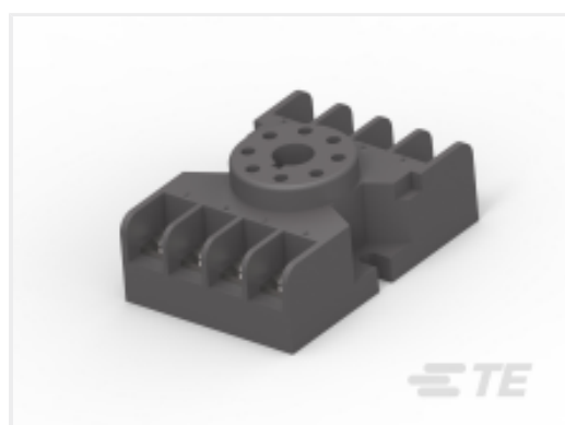
TE Part #1393143-6 27E122=SOCKET,KRP,8,SCW,SURF-MOUNT