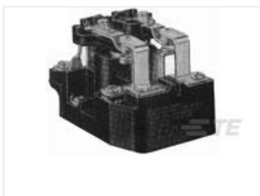
TE Part #2-1393127-6 PRD-11AY0-120=PRD