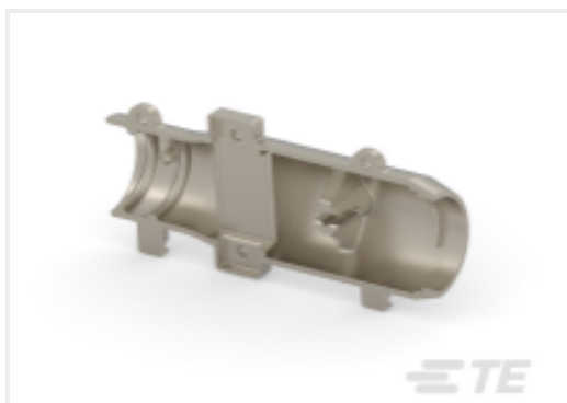
TE Part #2213906-2 BOTTOM SHELL, 2.5SQMM, NECTOR M-LINE