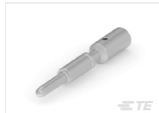
TE Part #293476-2 NECTOR M PIN CTC BRASS TIN PLTD CONN.NL