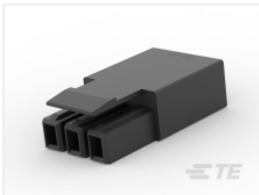
TE Part # 2834054-2 PLUG, 3P LATCHED POKE-IN WTW CONN.BK