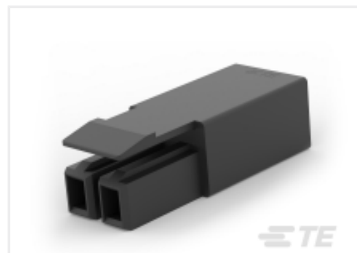
TE Part #2834048-2 PLUG, 2P LATCHED POKE-IN WTW CONN.BK