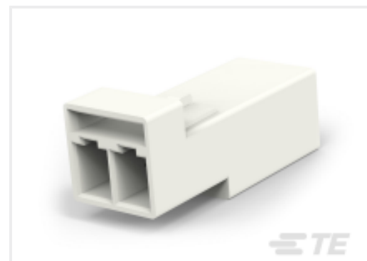
TE Part #2834049-1 REC, 2P LATCHED POKE-IN WTW CONN.NL