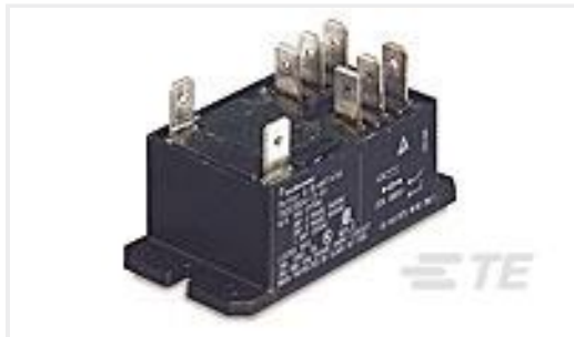
TE Part #1393212-5 T92S7A22-240