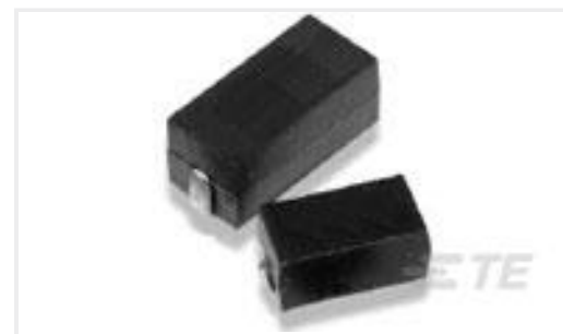
TE Part #6-1879021-3 SMW3 39R 5%