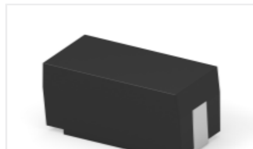
TE Part #3-2176616-7 SMQW2W 3R3 5%