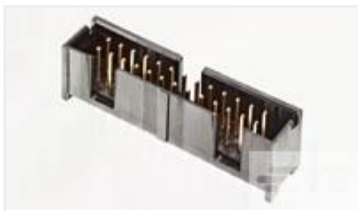
TE Part #1-5103308-3 A/L LOW PRO HDR 24P VERT BLACK