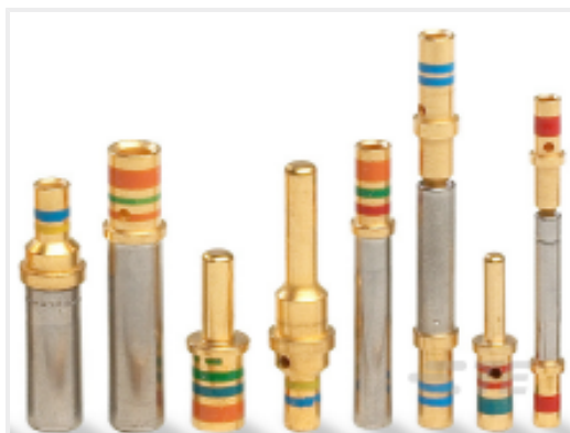
TE Part # 2560-212-2231 CONT PIN