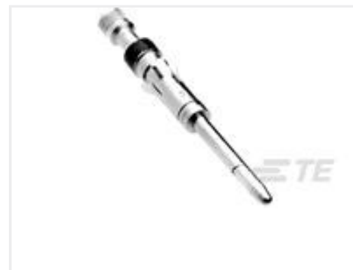
TE Part #201330-1 CONTACT PIN ASSY.