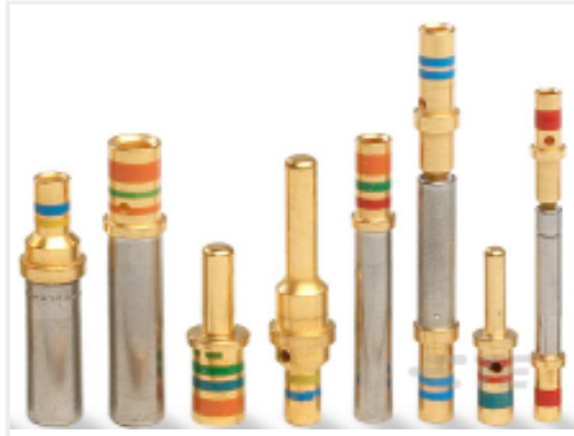
TE Part #4160-203-1631L CONT PIN