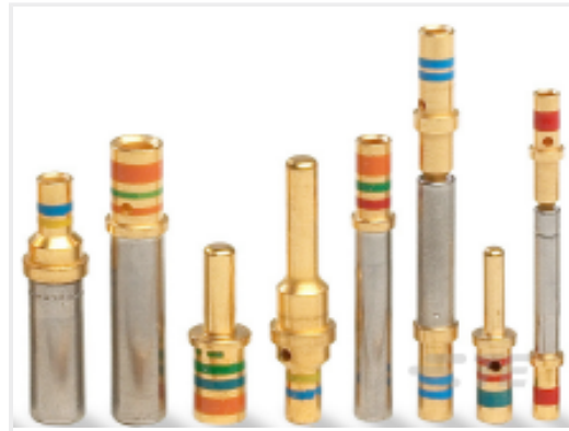
TE Part #1841-1-5620 CONT PIN