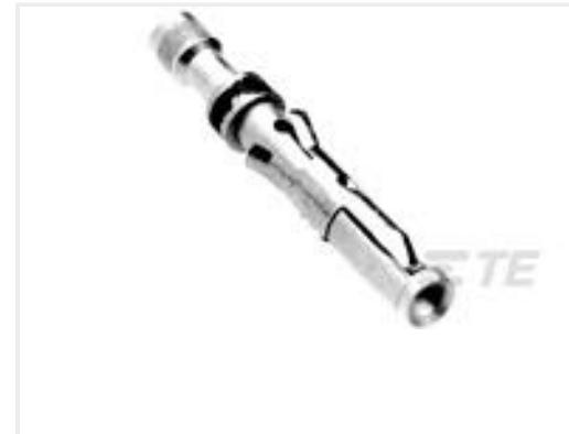
TE Part #201328-1 CONTACT SOCKET ASSY.