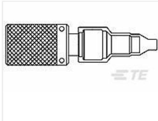
TE Part #902973-000 DK-621-0411-P