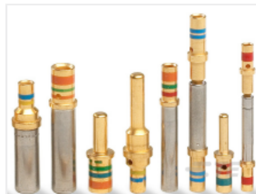
TE Part #0662-207-1631L CONT SOC ASSY