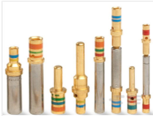
TE Part #1662-213-2031 CONT SOC ASSY