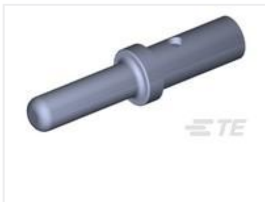
TE Part #2-592404-1 5000-027-0020