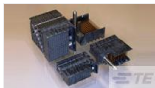
TE Part #2007808-2 IMP100S,H,V4P10C,LG,OEW46,4.9