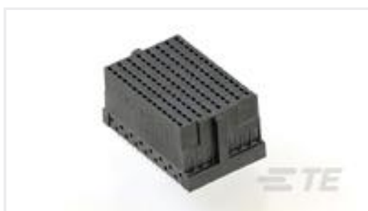
TE Part #1934949-1 Tinman 5pr 8col vert rcpt 15mm stack