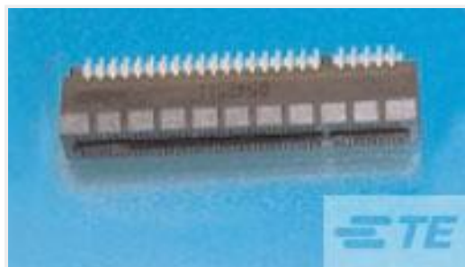
TE Part #1-1871058-5 PCI EXPRESS CONN. EON TYPE, 280P, L=3.25