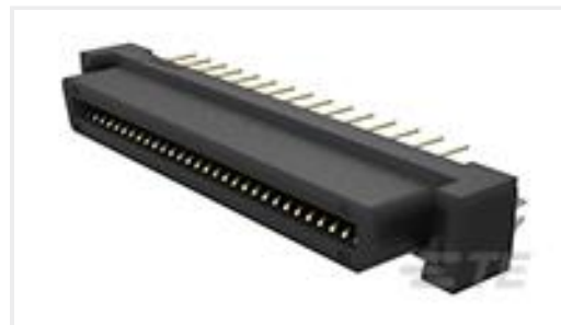
TE Part #1734101-3 Champ050 series,30pos,Au over PdNi