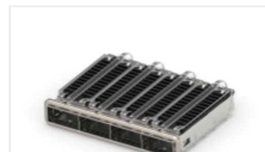
TE Part #1-2170287-1 1X4 CAGE ASSEMBLY, QSFP,SINGLE SQ LP