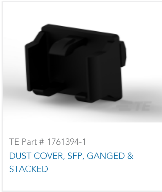
TE Part # 1761394-1 DUST COVER, SFP, GANGED & STACKED