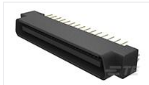
TE Part #1734100-3 Champ050 series,30pos,Au over PdNi