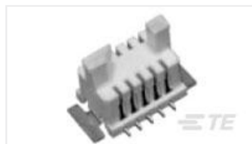
TE Part #5-1375870-4 RCPT ASSY,12 POS,VERT,0.8MM MI