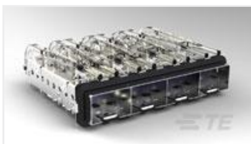
TE Part #2110570-1 SFP+ 1x4 Cage Assembly Square Light Pipe