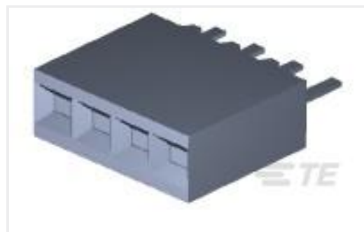
TE Part #534237-2 04 MODII VRT SR CE 100/115