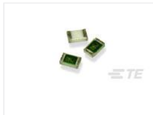
TE Part #6-1879337-8 CPF 0603 12K4 1% 50PPM 1K RL