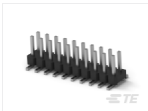
TE Part #1-2842142-0 20P,2MM,BRK HDR,DRV,T,SMD,0.1AU, TR W/CAP