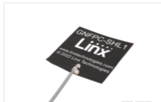
TE Part #L9000344-01 Antenna GNSS FPC SH L1 25x25 100 UFL