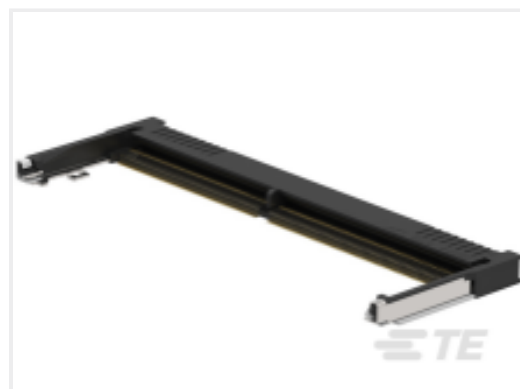
TE Part #2309408-2 DDR4 SODIMM 260P 4.0H RVS