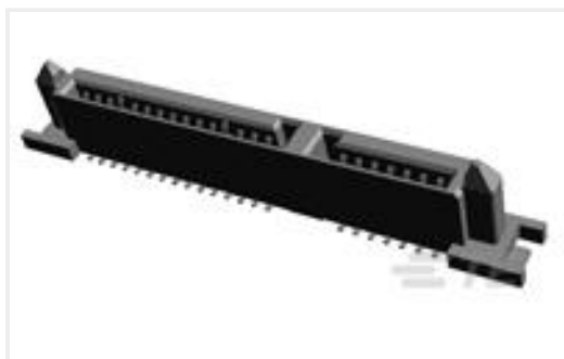
TE Part #1735284-3 SATA BACKPLANE RECEPTACLE, VERTICAL, SMT