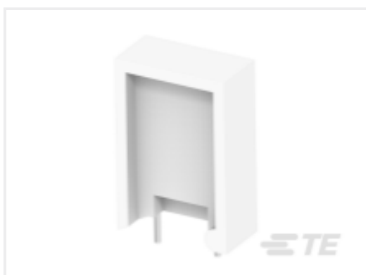
TE Part #2176633-5 SQMB10 1R5 (WIRE) 5%