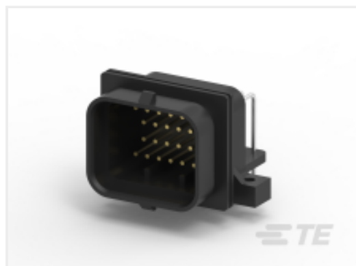
TE Part #2-6437285-9 SUPER SEAL 26POS CAP ASSY H AU