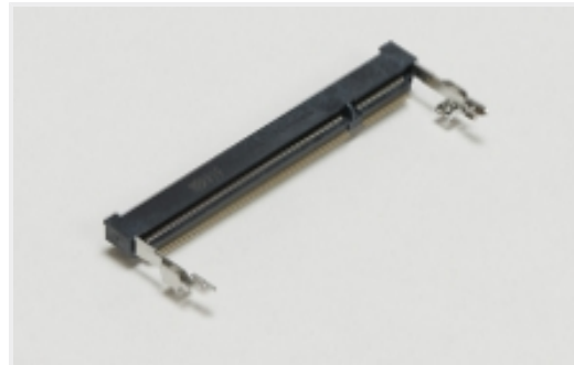
SO DIMM Sockets(39)