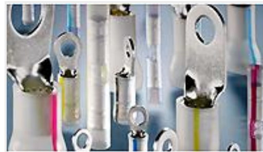
TE Part #53423-1 TERMINAL,PIDG PVF2 R 12-10 6