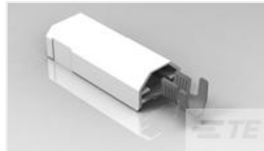
TE Part #521227-2 ULTRA-POD 250 ASSY TAB 12-10 AWG TPBR