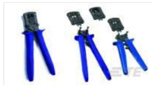
TE Part #1-1579004-2 CSV10 CRIMPING HANDTOOL SOLARLOK 4-6