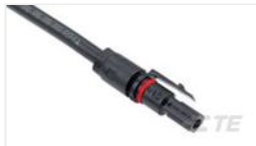
TE Part #1987559-1 PHOTOVOLTAIK CONNECTOR, 2.5 sqmm