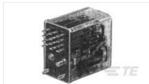
TE Part #1393766-3 R10-E1X2-S800=R10