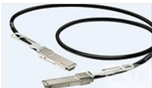
TE Part # 2829040-4 QSFP IB EDR, 30AWG, 1.0M