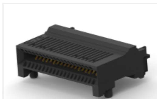
TE Part # 1551920-2 zQSFP+ connector assembly