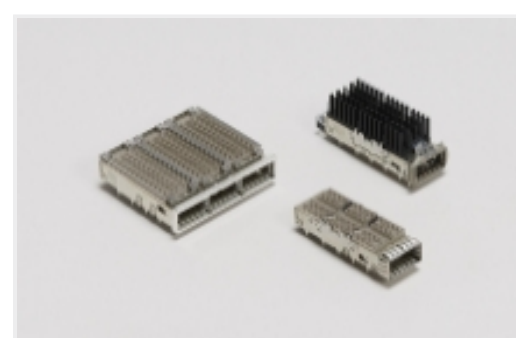
QSFP, QSFP+ & zQSFP+(424)