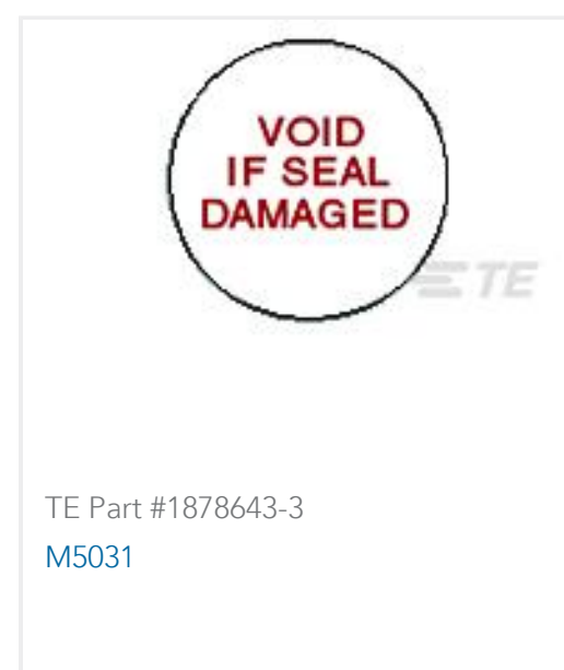
TE Part #1878643-3 M5031