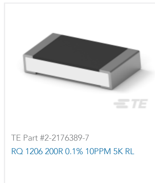
TE Part #2-2176389-7 RQ 1206 200R 0.1% 10PPM 5K RL