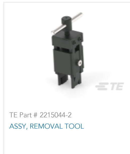
TE Part # 2215044-2 ASSY, REMOVAL TOOL