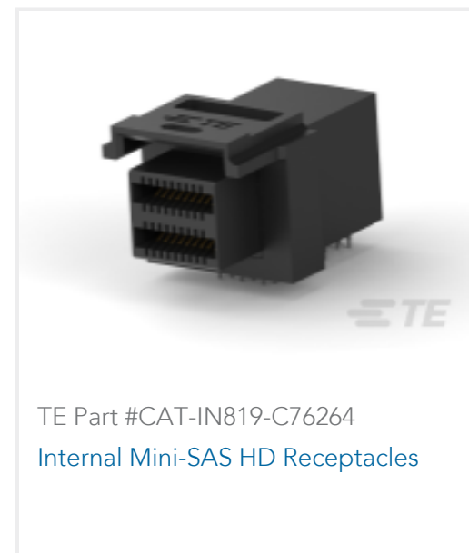
TE Part #CAT-IN819-C76264 Internal Mini-SAS HD Receptacles