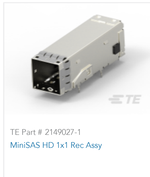
TE Part # 2149027-1 MiniSAS HD 1x1 Rec Assy