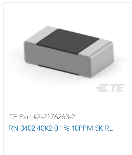
TE Part #2-2176263-2 RN 0402 40K2 0.1% 10PPM 5K RL