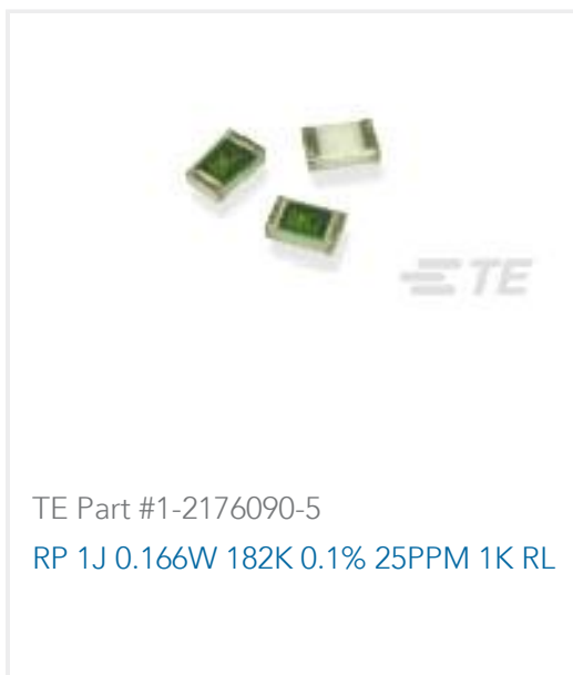
TE Part #1-2176090-5 RP 1J 0.166W 182K 0.1% 25PPM 1K RL