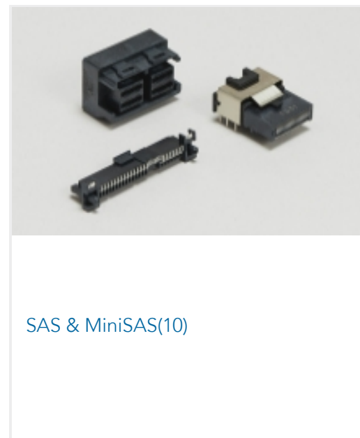
SAS & MiniSAS(10)