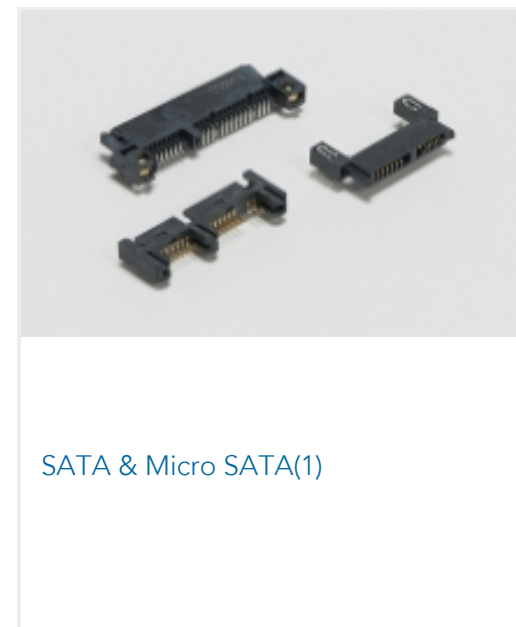
SATA & Micro SATA(1)