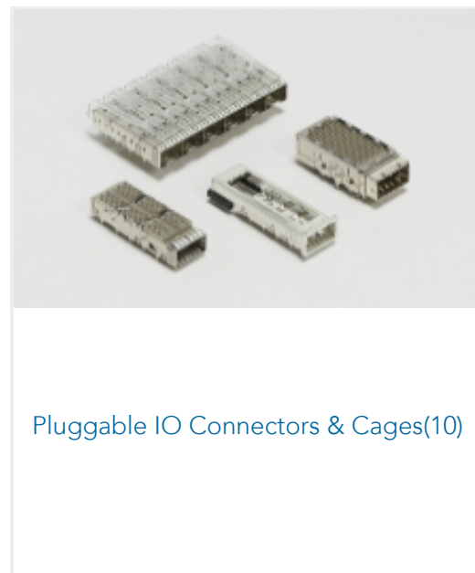
Pluggable IO Connectors & Cages(10)