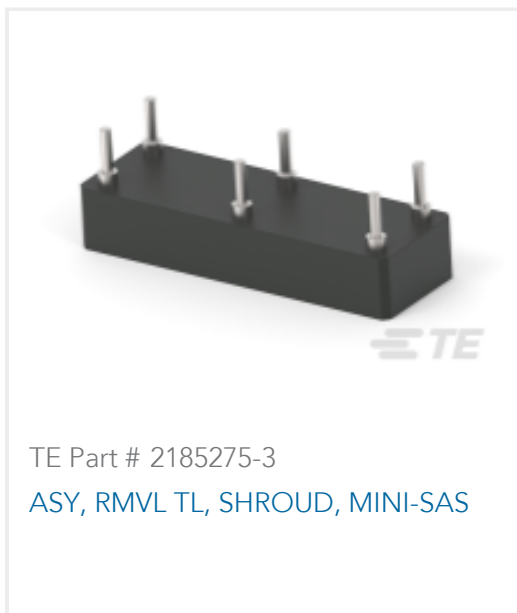
TE Part # 2185275-3 ASY, RMLV TL, SHROUD, MINI-SAS