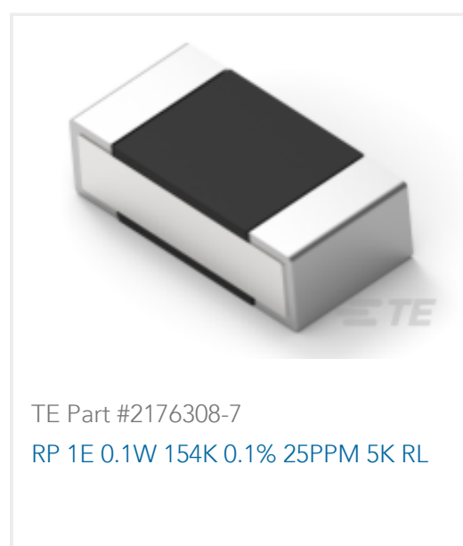
TE Part #2176308-7 RP 1E 0.1W 154K 0.1% 25PPM 5K RL