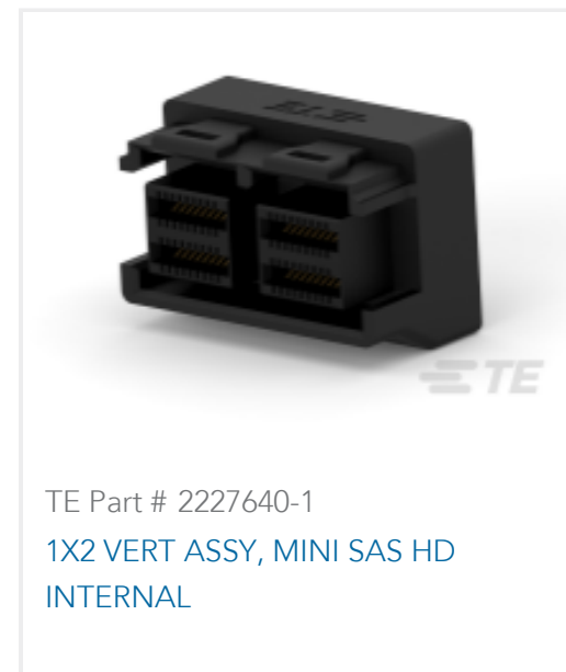
TE Part # 2227640-1 1X2 VERT ASSY, MINI SAS HD INTERNAL