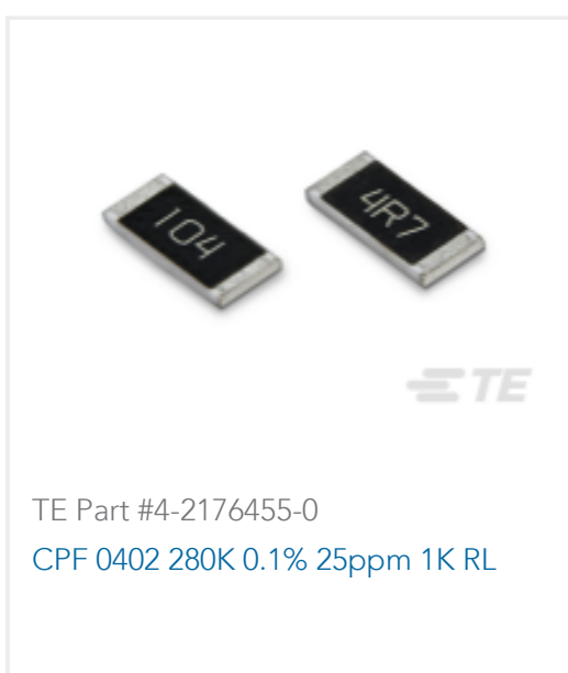
TE Part #4-2176455-0 CPF 0402 280K 0.1% 25ppm 1K RL