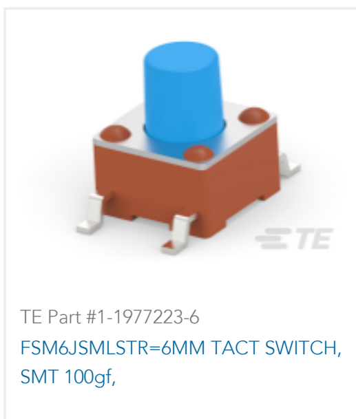
TE Part #1-1977223-6 FSM6JSMLSTR=6MM TACT SWITCH, SMT 100gf