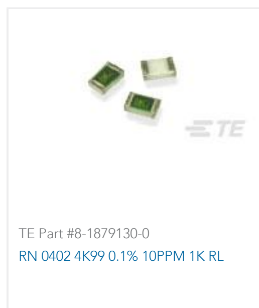
TE Part #8-1879130-0 RN 0402 4K99 0.1% 10PPM 1K RL