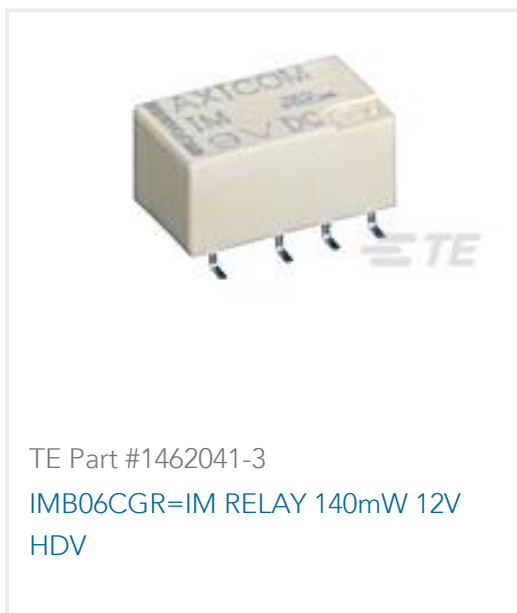
TE Part #1462041-3 IMB06CGR=IM RELAY 140mW 12V HDV