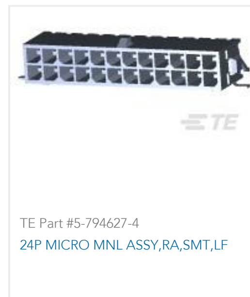
TE Part #5-794627-4 24P MICRO MNL ASSY,RA,SMT,LF AU