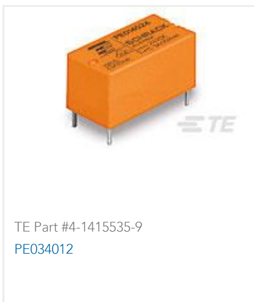
TE Part #4-1415535-9 PE034012