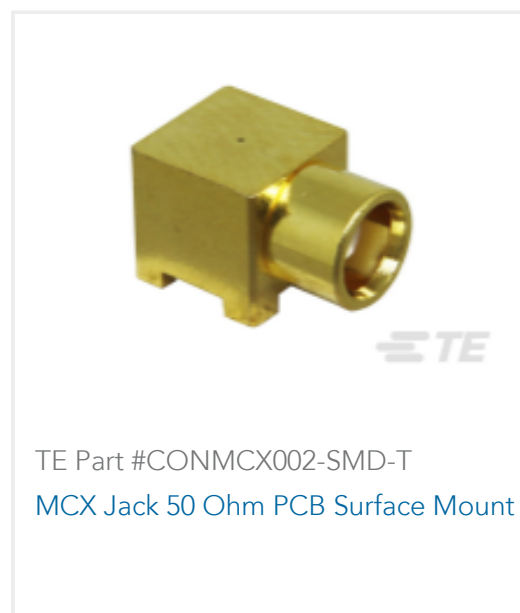
TE Part #CONMCX002-SMD-T MCX Jack 50 Ohm PCB Surface Mount