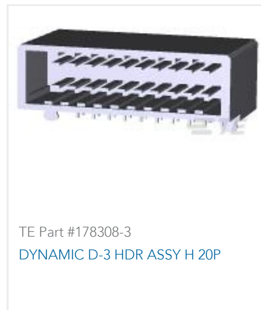
TE Part #178308-3 DYNAMIC D-3 HDR ASSY H 20P