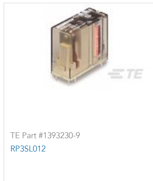
TE Part #1393230-9 RP3SL012