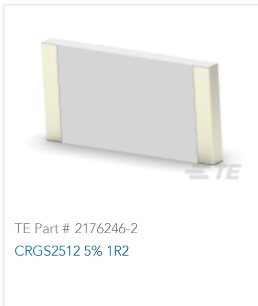
TE Part # 2176246-2 CRGS2512 5% 1R2