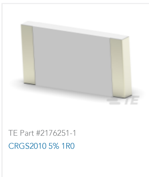
TE Part #2176251-1 CRGS2010 5% 1R0