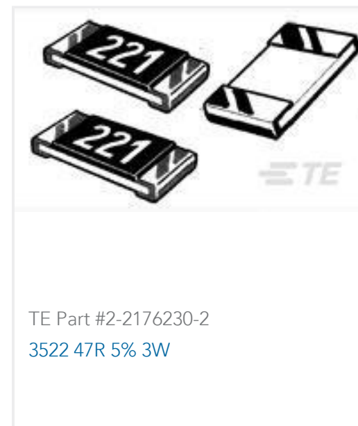
TE Part #2-2176230-2 3522 47R 5% 3W