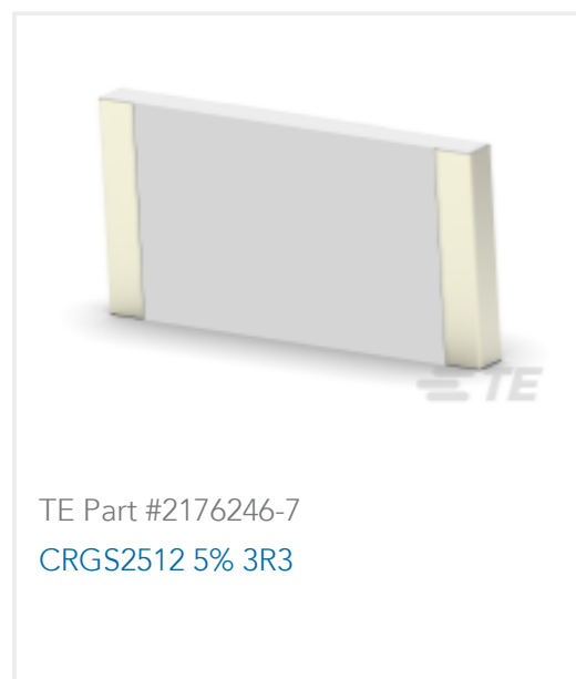
TE Part #2176246-7 CRGS2512 5% 3R3