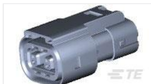
TE Part #2103149-4 PLUG, HVIL ONLY, KEY D, HVA280- 2PHI