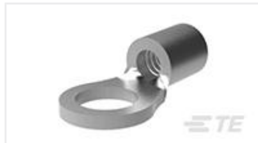
TE Part #2-35772-1 TERMINAL, SOLIS R 12-10 1/4