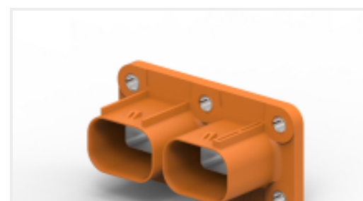
TE Part #2103346-2 HVA280 2 Bay Header Sub-Assy, KEY D, F