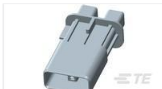
TE Part #2103245-6 Inner Housing, Split Hdr, Key F, HVA280