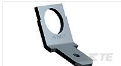
TE Part #1217050-1 187 FASTON, TAB, TPBR